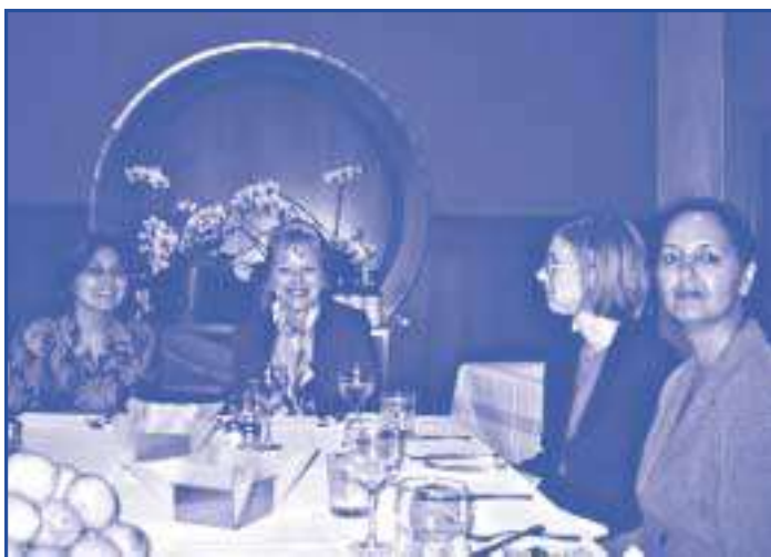
ORIGIN meeting, Toronto, Canada, 13-14 June 2002