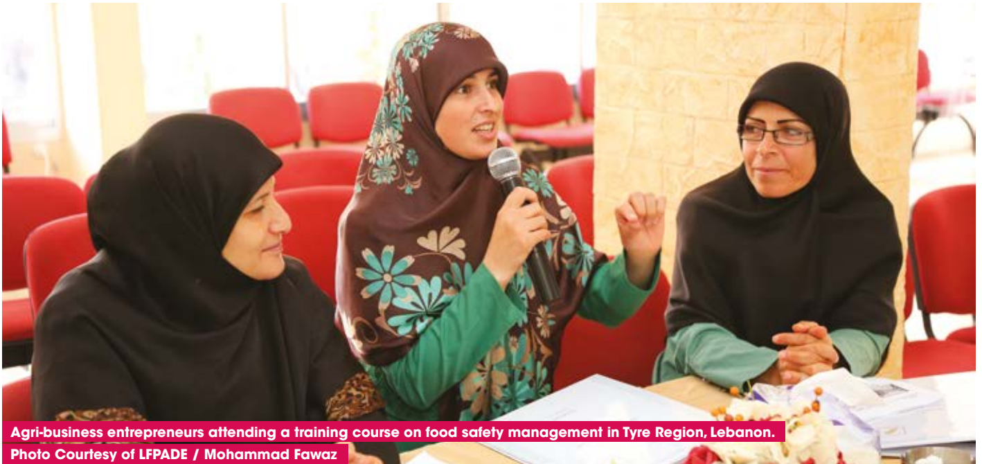
Agri-business entrepreneurs attending a training course on food safety management in Tyre Region, Lebanon.

LFPAGE and Green Lane plan to continue exchanging experiences on social enterprises and to attend joint trainings in marketing and branding with another field visit to Lebanon planned for July 2019.