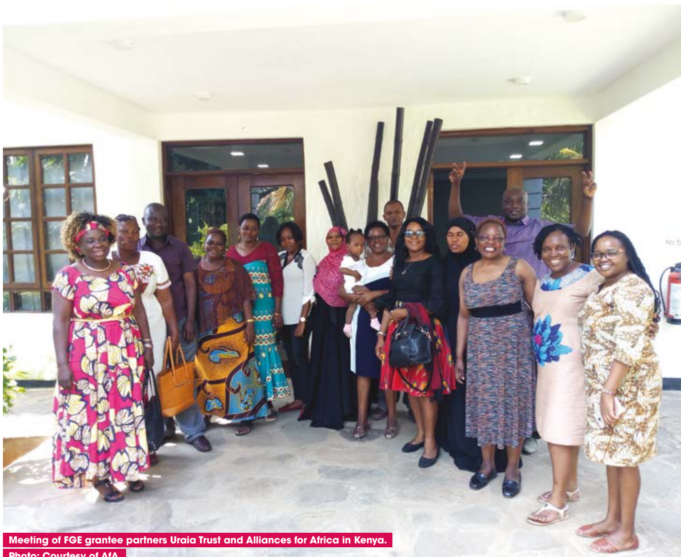
Meeting of FGE grantee partners Uraia Trust and Alliances for Africa in Kenya.

The two adopted a cross-border strategy to sustain their solidarity in countering common roadblocks.