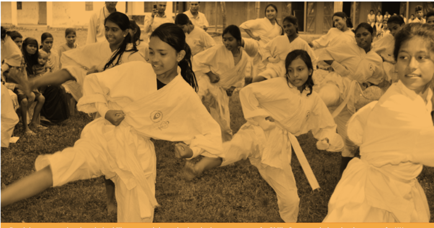
Participants are showing their skills on martial arts in the closing ceremony of a Skills Camp at their school as part of a UN Trust Fund supported project in Bangladesh.

This was the vision at the core of the resolution adopted by the United Nations General Assembly in 1996 - just a year after the Beijing Platform for Action - which established the UN Trust Fund. Resolution 50/166 sent out a strong message that violence against women and girls was a priority for the United Nations. It also set out a clear trajectory for the Fund's future mission. It called on the UN Trust Fund to act as a catalyst and to support innovative activities that directly benefit and empower women. The scope was also set: the UN Trust Fund was to support initiatives at the national, community and international levels and to foster system-wide collaboration with other relevant UN bodies. Established as a system-wide mechanism, the UN Trust Fund was