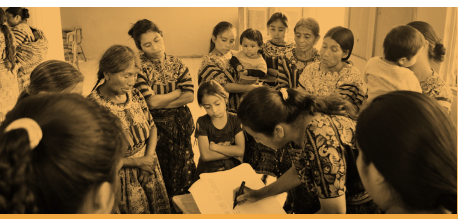
Beneficiaries participating in a Women's Justice Initiative training activity in Guatemala.

Every year since 1996, the UN Trust Fund has provided funding to civil society organizations, governments and, from 2008—2014, UN Country Teams. The process for awarding grants is competitive, open and transparent and ensures funding is targeted at those working in the UN Trust Fund's priority areas. Transparency and consultation are paramount in ensuring that the Fund remains relevant and effective. Calls for proposals for grants are issued through an open and competitive selection process. Grant applications are reviewed by independent experts and an inter-agency Programme Advisory Committee [PAC]<sup>v</sup> that draws on the expertise and experience of UN agencies, representatives of leading non-governmental organizations and other experts in the field.