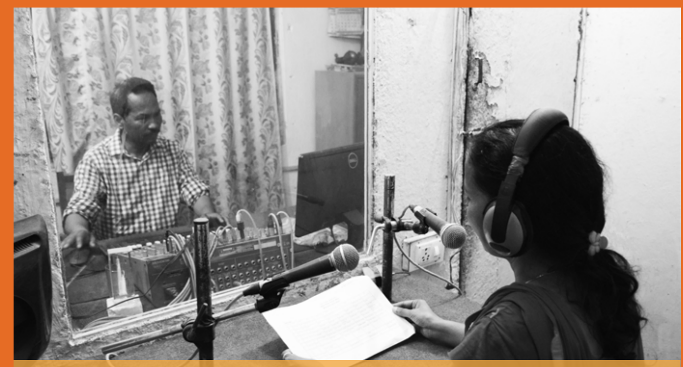
Grantee The Story Kitchen engages women survivors of violence from conflict to tell their stories through media such as the radio.

"I had forgotten to smile after seeing fifteen people killed in front of my eyes, after coming to this workshop and meeting with other sisters the smile has returned back."