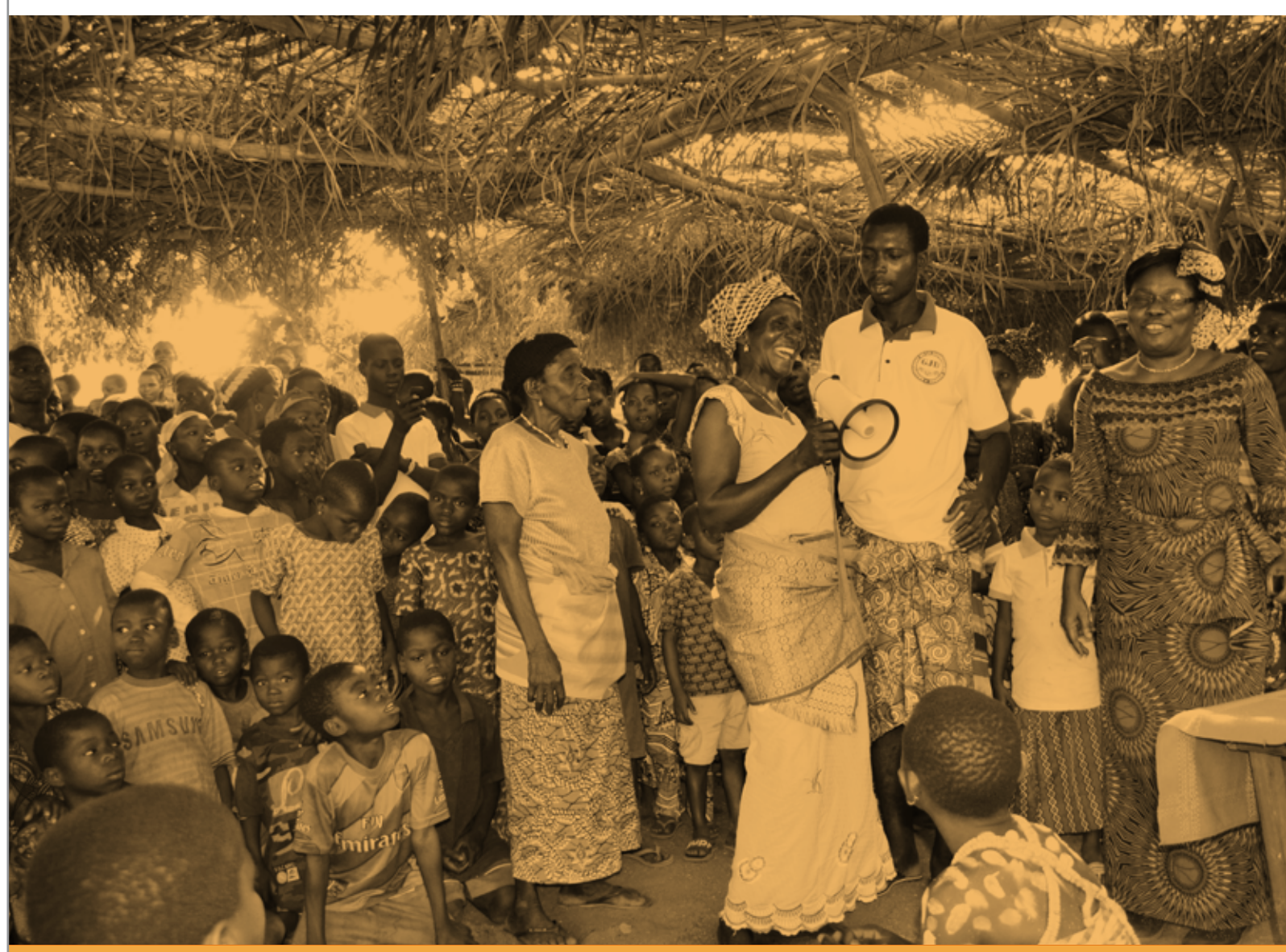
The UN Trust Fund visited ALAFIA in Togo which works to end harmful widowhood practices.

train 25 paralegals in violence against women, women's rights and how to support survivors and reached 2,508 market traders. Fifty-four cases of gender-based violence have been referred to police.