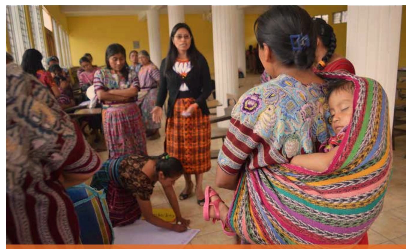
Legal Literacy Workshop with programme graduates and provision of rural legal aid in Chimaltenango, Guatemala.