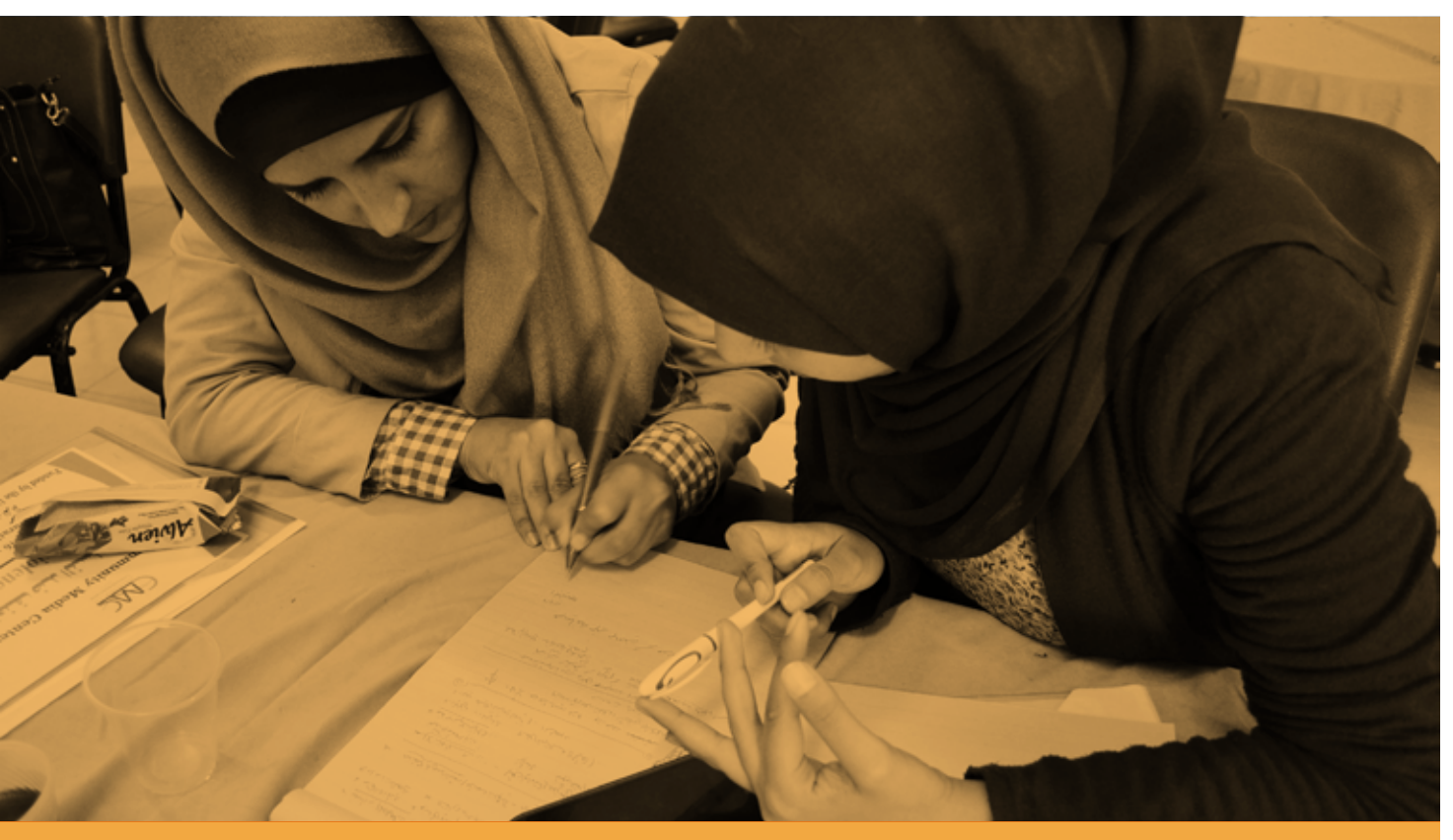
Participants in the Community Media Center in the State of Palestine take a social media training.

reflecting changes in the work on ending violence against women and girls at the normative, policy and implementation levels. At the international level, conventions and protocols have been complemented by the development of policy instruments. These provide detailed guidance on the steps that States and other stakeholders need to take to prevent and end violence against women and girls. Some have taken the form of declarations and resolutions adopted by United Nations bodies and documents emanating from United Nations conferences and summit meetings.