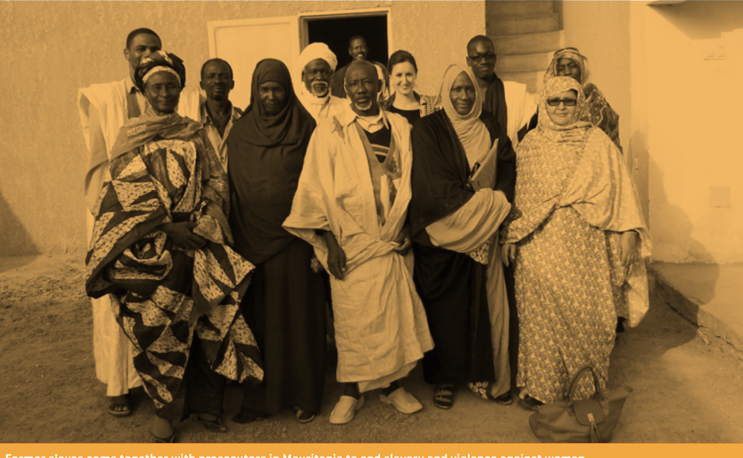
Former slaves come together with prosecutors in Mauritania to end slavery and violence against women.

The report also noted that the projects contributed to changing or implementing legal or policy frameworks at the country and local levels and that most had integrated human rights and gender equality approaches. In its funding analysis and strategies, the UN Trust Fund has also explicitly identified organizations working with men and boys as eligible to apply for grants and stressed the importance of greater awareness and understanding of the need to work with them as active agents of change. For example, several projects in the 13th grant-making cycle (2008) specifically involved men and boys. More than half the projects that have