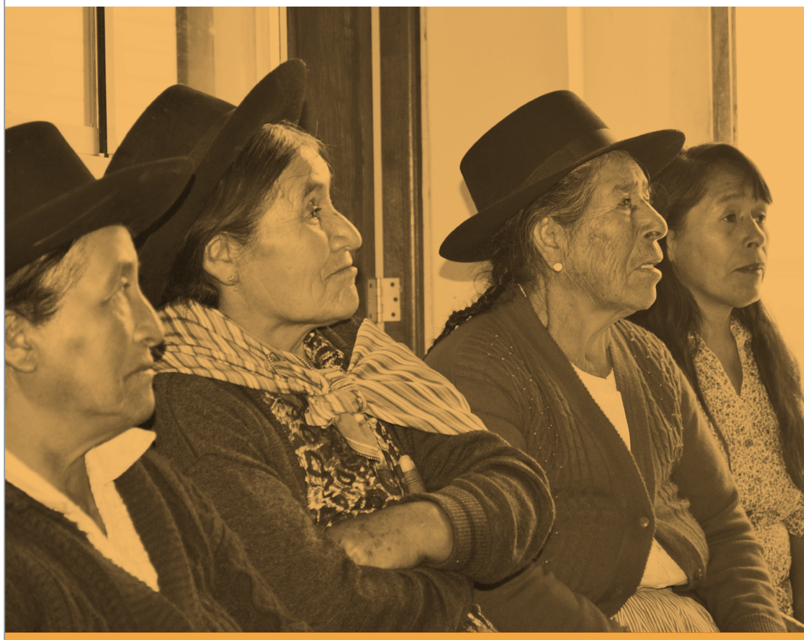
Attendees participate in an elderly association meeting of the Ayacuyo Community in Peru.

on the importance of reforming justice processes in order to implement the new Code effectively. The city of Junin has approved a Protocol on the Constitution of a Unified Declaration Procedure for Victims of Sexual Violence which was drafted by DEMUS.