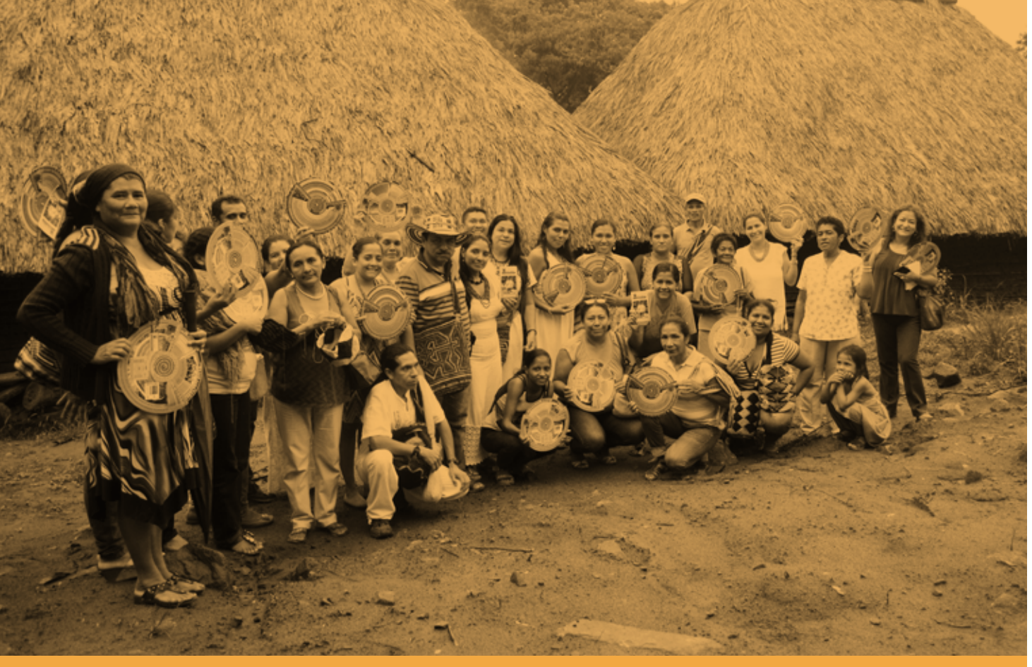
Meeting with the Kankuamo indigenous community. The Integral assistance route provides information on how to access protection and legal assistance in Valledupar, Colombia

governments and United Nations partners. Similarly, its vision and mission have also evolved since its inception in 1996. Initially, the Fund's immediate aim was "to support national, regional and international actions, including those taken by governments and non-governmental organizations, to eliminate violence against women." Over the years, the scope of the portfolio broadened and the group of grantees diversified. Funding increased considerably and special funding windows were launched (for example, violence against women and HIV/AIDS, in conflict and postconflict settings and the experience of adolescent girls).