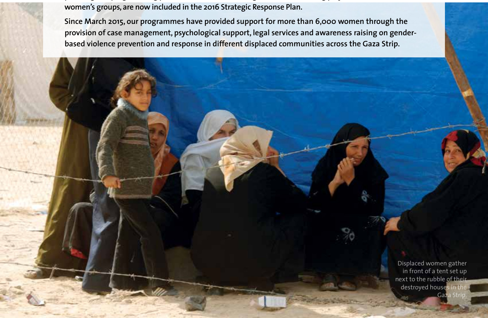
Displaced women gather in front of a tent set up next to the rubble of their destroyed houses in the Gaza Strip.

Since March 2015, our programmes have provided support for more than 6,000 women through the provision of case management, psychological support, legal services and awareness raising on gender-based violence prevention and response in different displaced communities across the Gaza Strip.