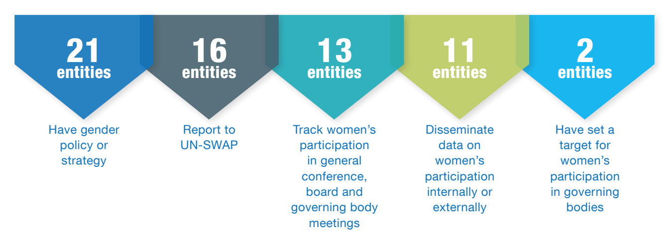
Figure V: Actions taken by organizations to advance gender balance

Women's participation in more technical organizations has remained a challenge, leading to the adoption of several decisions. The low number of women in the WMO Congress and Executive Council has been attributed to the low number of women permanent representatives with WMO globally. Women's participation in the WMO Congress has edged up from 20 per cent in 2011 (when the WMO Policy on Gender Mainstreaming was adopted) to 24 per cent in 2014 and 27 per cent in 2015. Women's participation in the Executive Council was 0–3 per cent from 2000 to 2006, rose to 14 per cent in 2013, but fell back to 11 per cent in 2014.28 In 2015, the WMO Congress, in its resolution 59 (Cg-17) on gender equality and empowerment of women, urged its members to increase the representation of women in their delegations to constituent body meetings and to nominate more women candidates for technical commissions and other bodies as well as for training and fellowships. The resolution updated the WMO Gender Equality Policy to further stipulate that technical commissions and regional associations should make efforts to ensure at least 30 per cent of the members of their working structures are women, with this percentage increasing progressively within each financial period, with a longer-term objective of reaching parity. The WMO Congress further called on policymaking organs, constituent bodies and top-level management to provide visible support, accountability and transparency to ensure gender equality.