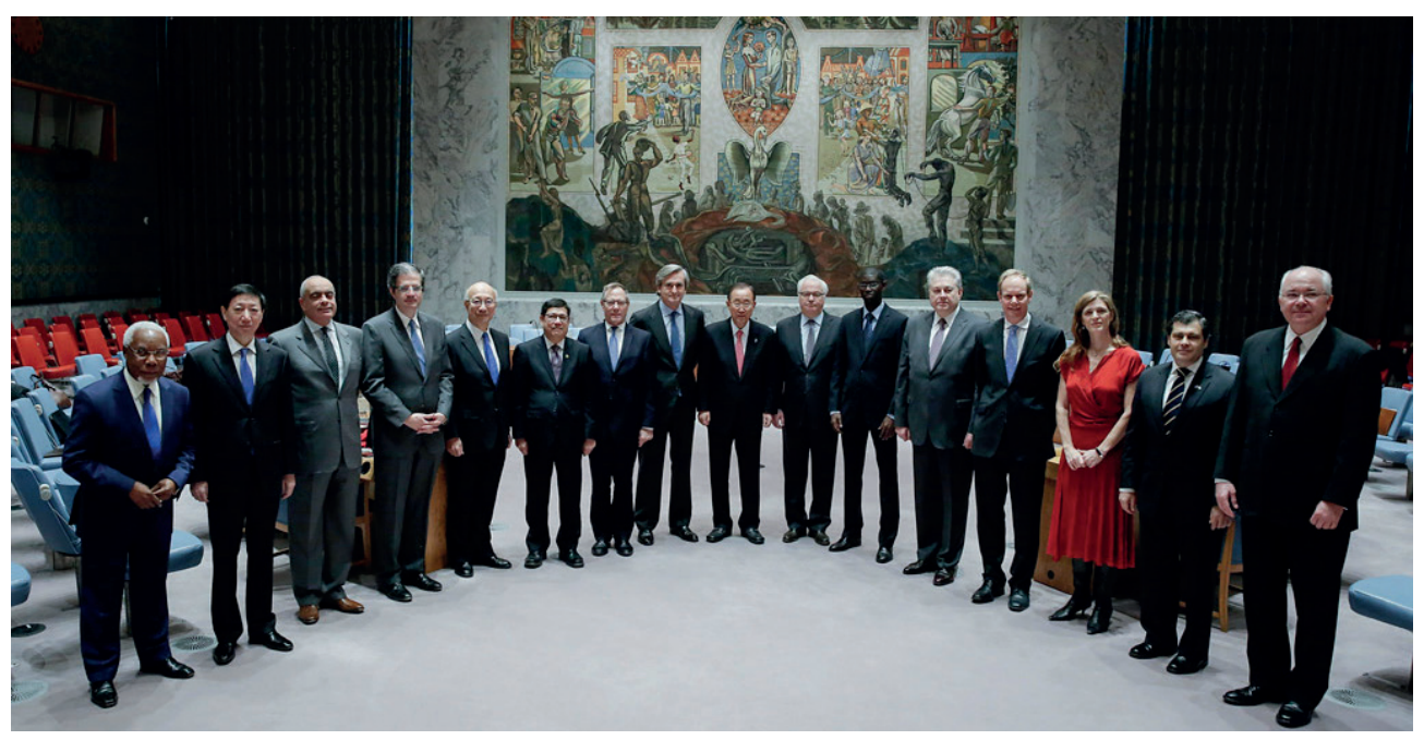
Figure III: Group photo with the representatives of members of the Security Council and Secretary-General Ban Ki-moon in December 2016

This underrepresentation of women in ambassadorial or senior positions leads to a lack of women at high-level intergovernmental meetings, including at Security Council debates. In the 49 meetings<sup>22</sup> that the Security Council held between 1 October and 13 December 2016, only one to three members (of a total of 15) were represented by women, with five meetings having no women take part at all.