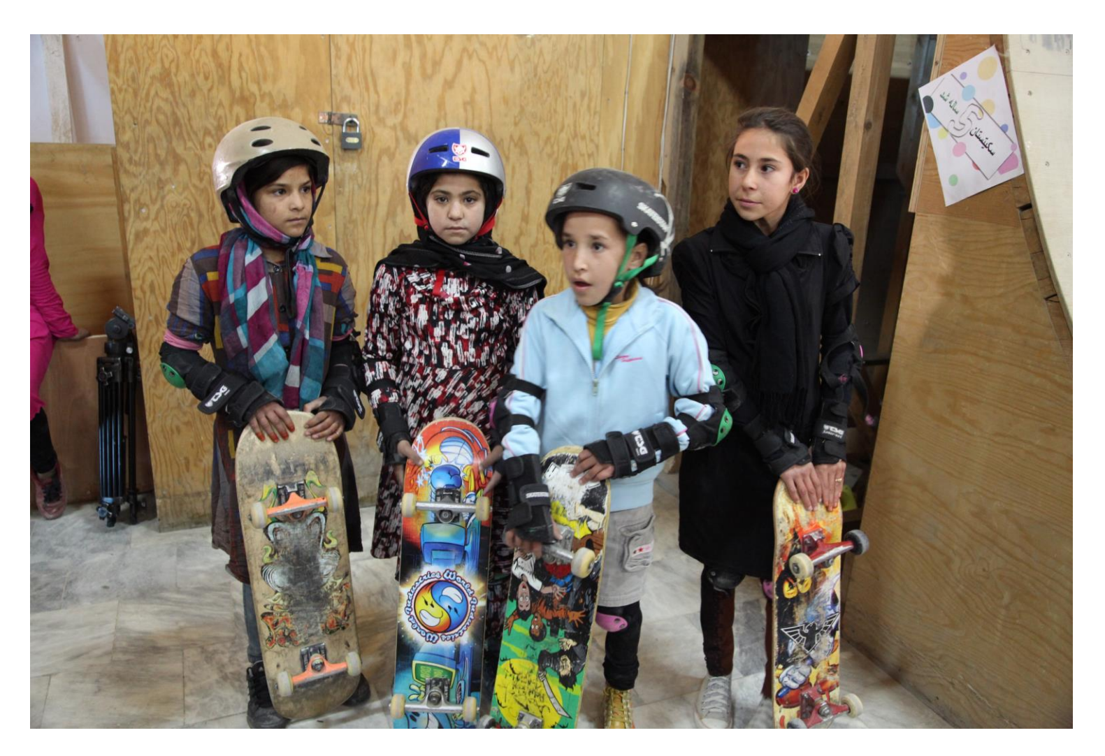
Girls play at Skatestan in Kabul.