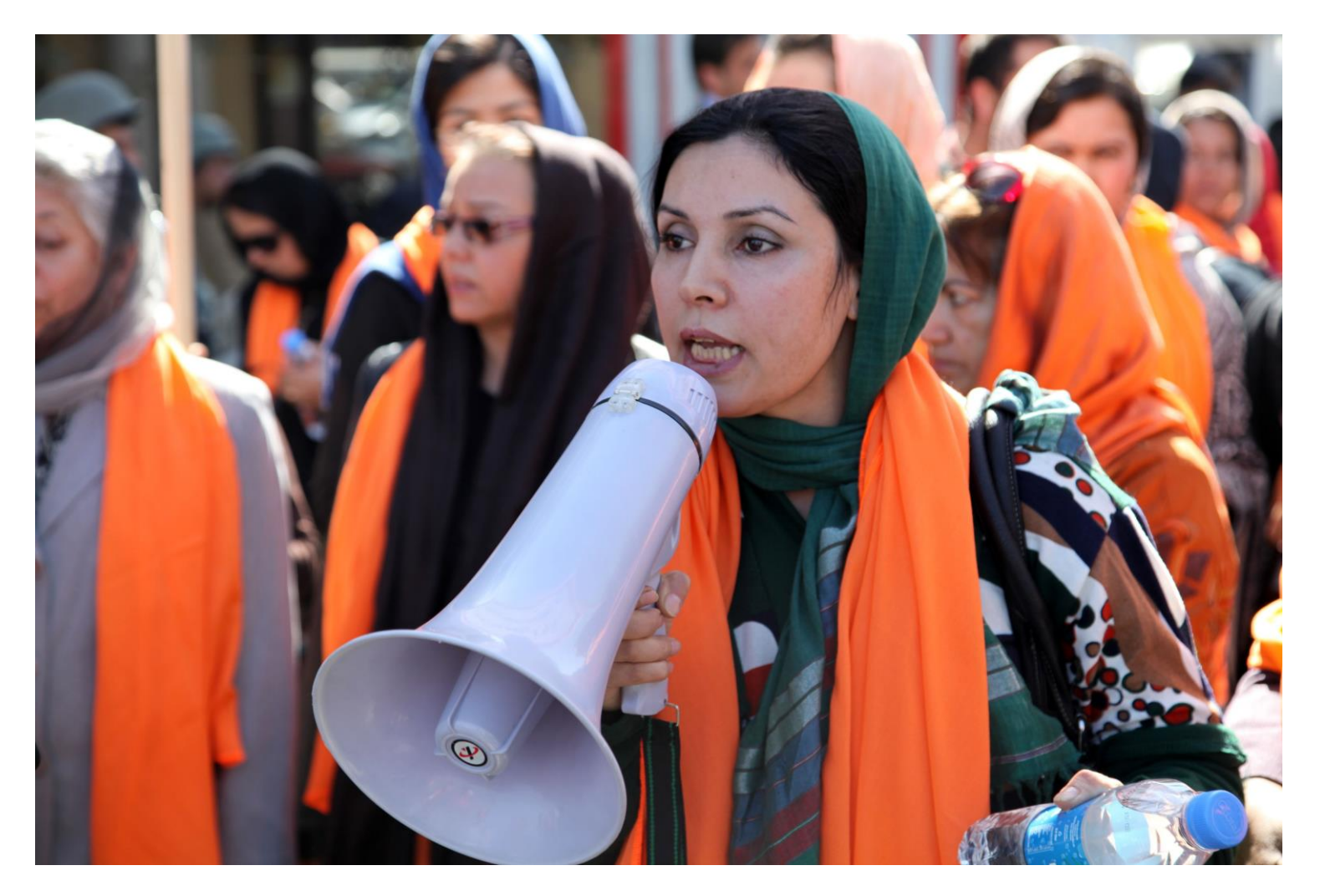
Orange Day, Kabul.