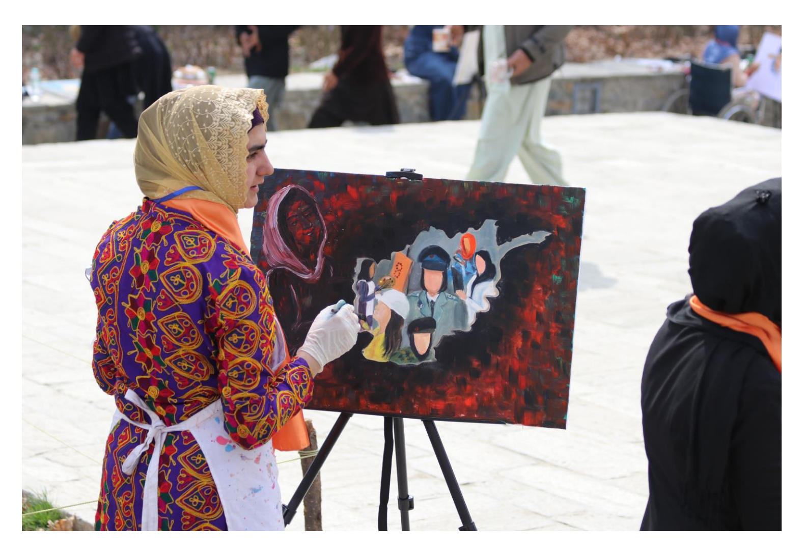
We can do all those jobs, Painting Festival, Kabul.