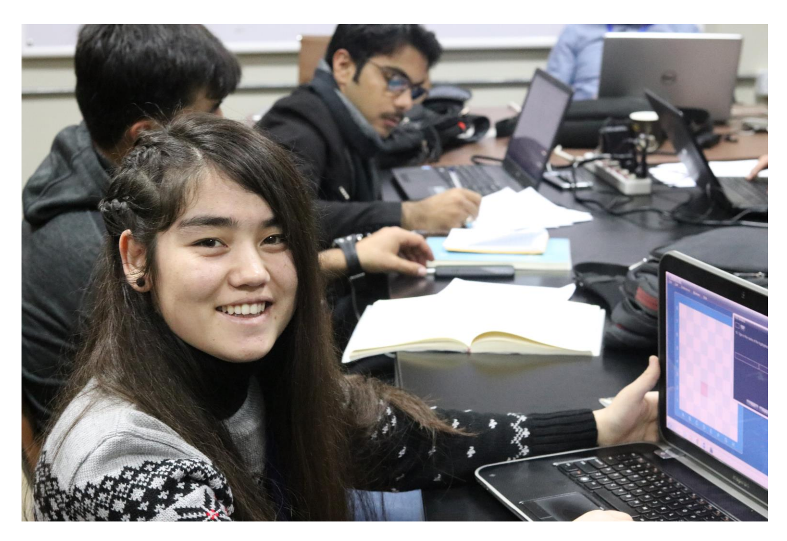
Women and girls in technology