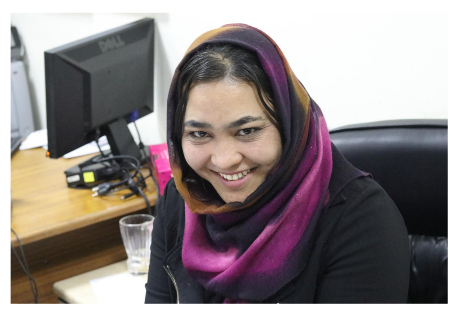
Afghan woman at work, Kabul.