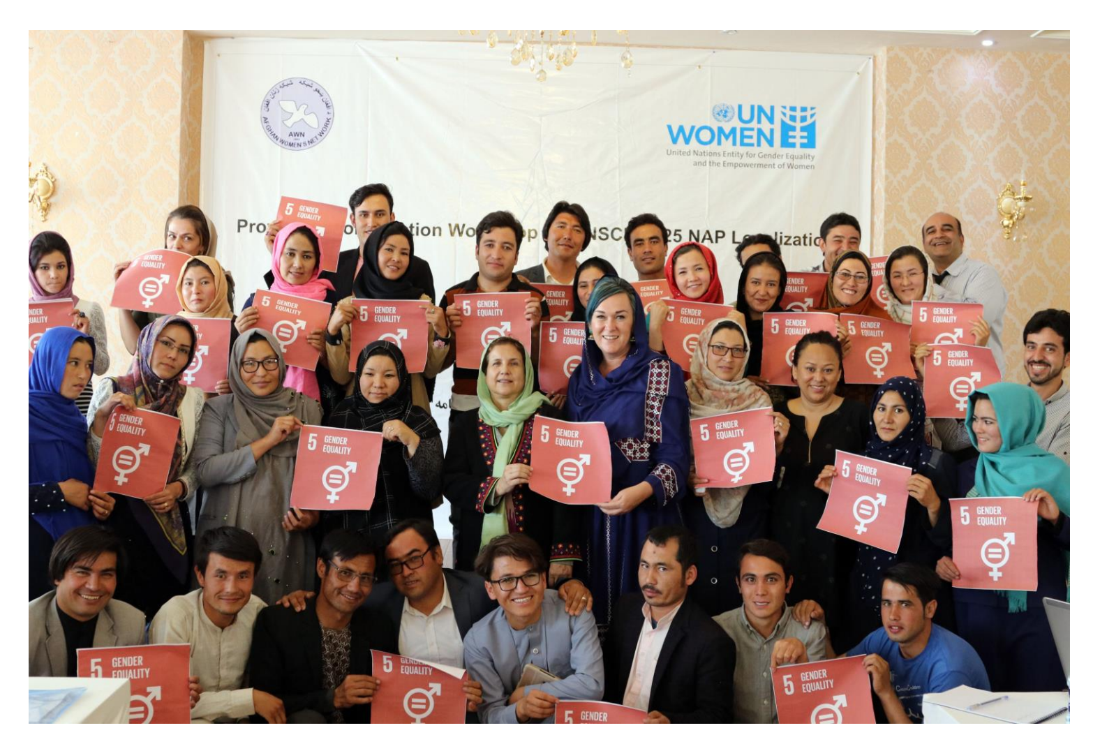
Young people unite for peaceful and just society, Bamyan.