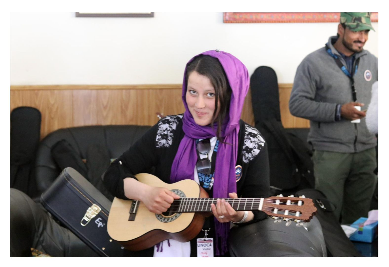
Celebrating our strength and success, The Miraculous Love Kids, Kabul.