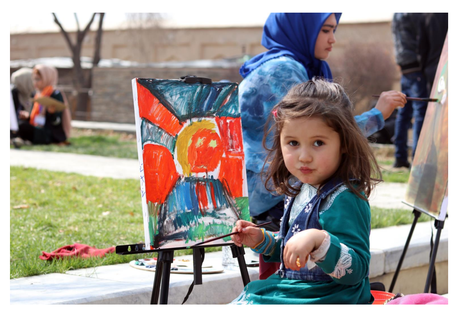
Painting the path for our future, Painting Festival, Kabul.