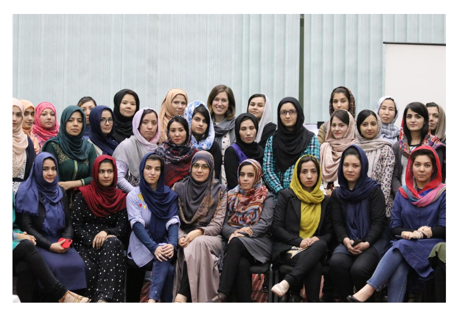
First group of Gender Responsive Budgeting Specialists, Kabul.