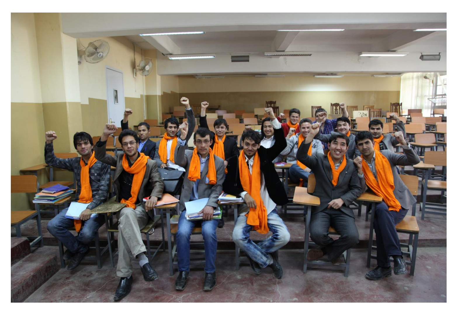
Afghan youth promise to stop violence against women and girls, Kabul University.