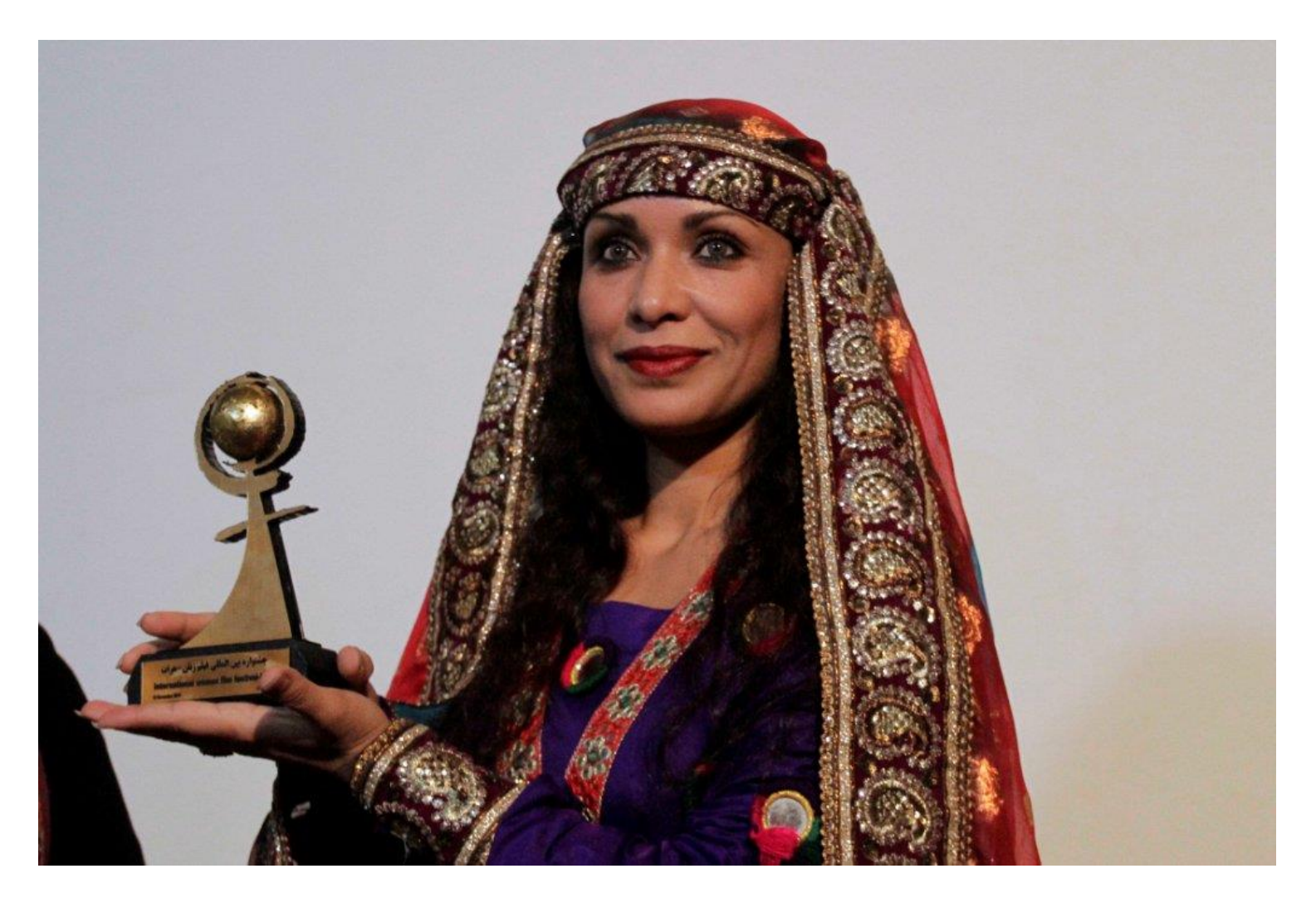
Film Festival in Herat Province of Afghanistan.