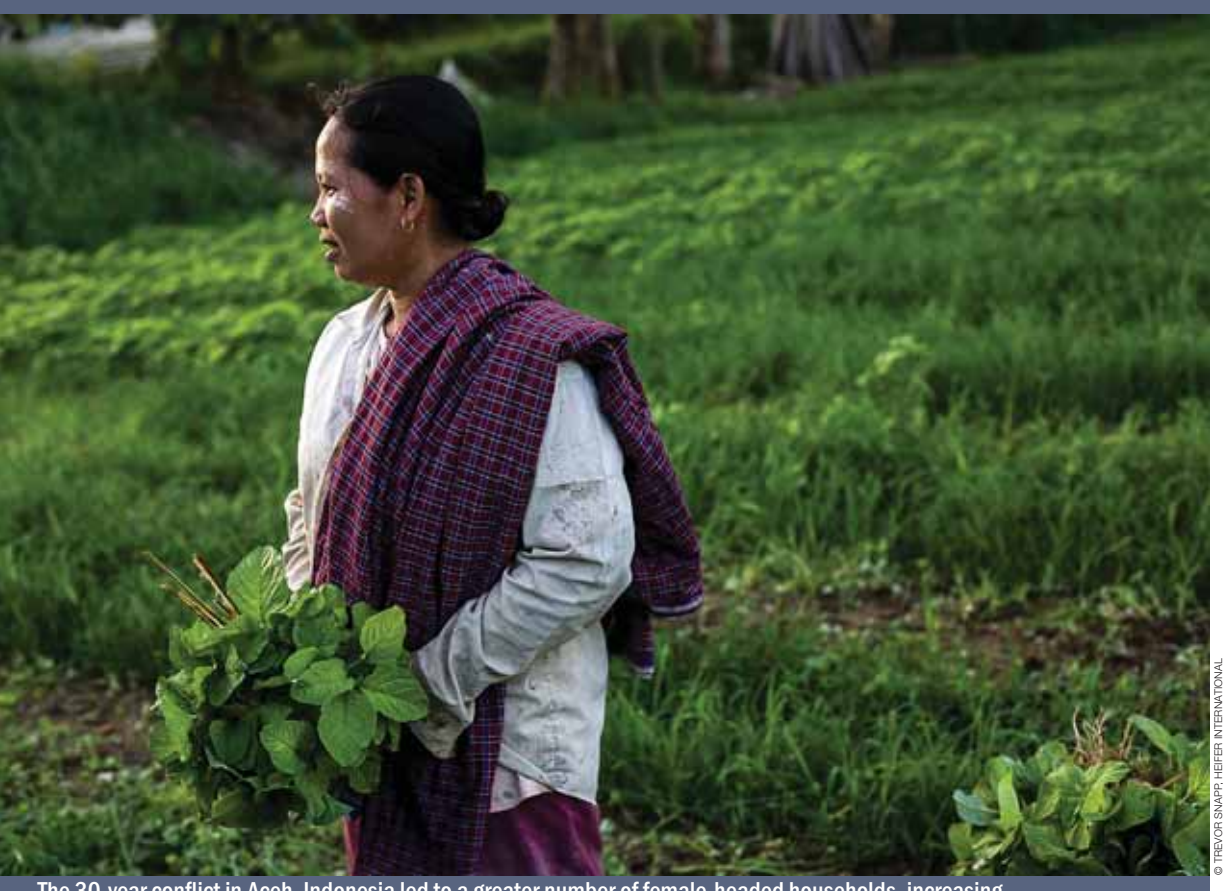
Case study 3. Women in agriculture in post-conflict Aceh, Indonesia