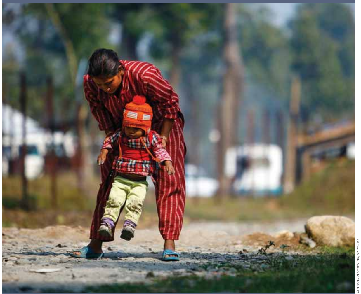
A former Maoist rebel walks with her child inside Shaktikhor Maoist Camp in Chitwan, Nepal. Many female Maoists face significant challenges to reintegrate into their communities, due to the fact that their participation in the conflict required them to break with traditional gender norms

As a complement to these efforts, the government of Nepal is trying to increase women's access to land by lowering the taxation on land registered under the name of a female family member. However, this has not been met with much success as many groups oppose women's land rights based on the fear of losing their traditional farming areas through the transfer of land rights via marriages. Further, in the complex post-conflict political environment, women's rights have also often lost momentum to "more pressing" issues. Despite these challenges however, some of the former female combatants are using the post-conflict social turmoil as an opportunity to act as ambassadors for gender equality in their communities, advocating for a change in repressive gender norms.