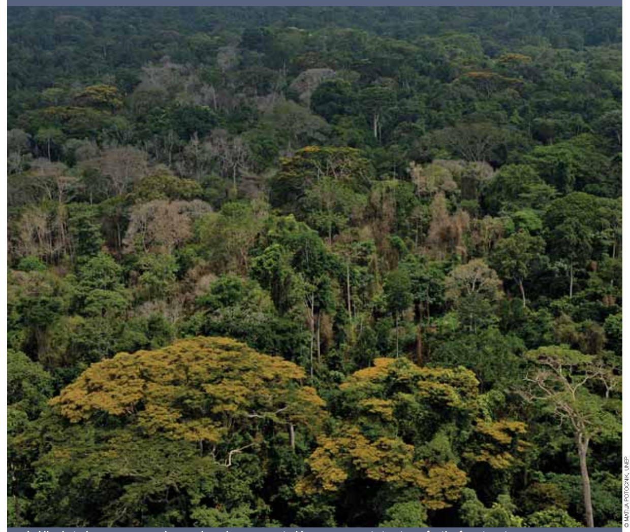
In Liberia today, women remain grossly under-represented in management structures for the forest sector

During the Liberian civil wars, from 1989 to 2003, revenue from timber exports was frequently used to finance arms. <sup>128</sup> As a result, the UN imposed sanctions on Liberian logs and timber in 2001, which were lifted in 2006 when President Ellen Johnson Sirleaf issued a moratorium on industrial logging and timber exports and cancelled all forest concession agreements, pending the passage of appropriate forestry legislation. <sup>129</sup>