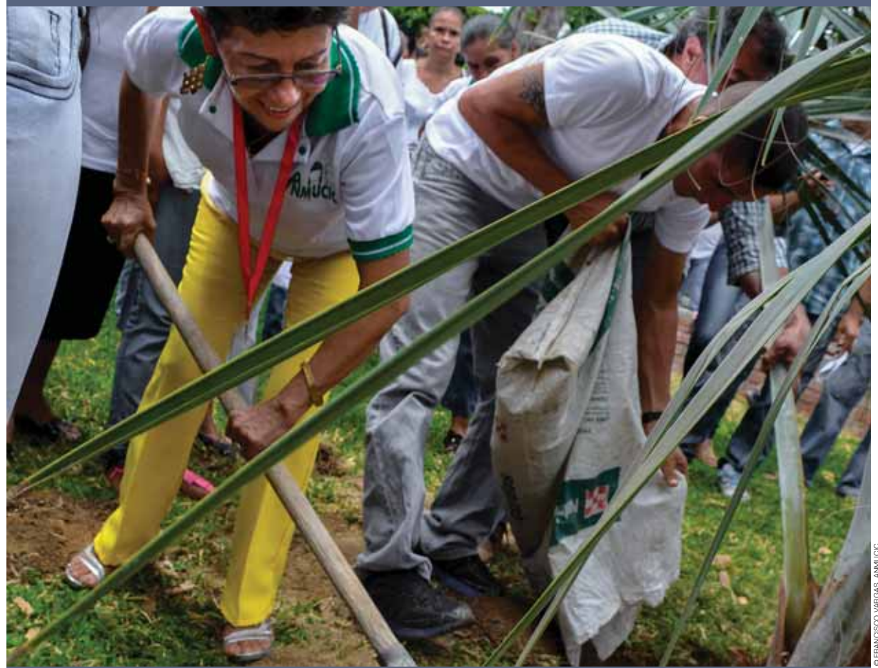
Members of the National Association of Rural, Afrocolombian and Indigenous Women of Colombia mark the beginning of a collective reparations process under the Victims and Land Restitution Act, which represents an important opportunity for returning land that was unlawfully taken during the conflict

In June 2011, Colombia ratified a Victims and Land Restitution Law (Law 1448/11) facilitating the restitution of land that was stolen or lost as a result of displacement during the conflict. Additionally, the law provides reparations for victims of conflict-related human rights abuses. <sup>199</sup> Under the new law, the members of ANMUCIC are eligible for collective reparations for being dispossessed of their land, as well as for the threats, killings and forced displacement that they endured. With support from the Colombian Special Administrative Unit for the Attention and Comprehensive Reparation of Victims and the Norwegian Refugee Council, the Association has been able to make progress on the identification of damages it has suffered as a result of the conflict. <sup>200</sup> Ensuring that the ANMUCIC women are successful in claiming reparations that sufficiently reflect the damage they suffered in terms of violence and lost livelihood opportunities would be an important benchmark for enforcing the rights guaranteed by the new law to the most vulnerable groups. If successful in accessing reparations for its members, the case of ANMUCIC in Norte de Santander could provide a positive legal precedent for other groups of women in similar situations. <sup>201</sup>