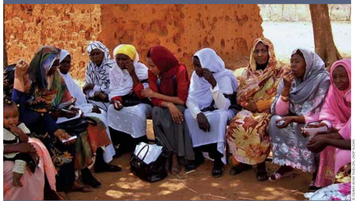
Engaging women in natural resource management could help foster more inclusive decision-making processes in South Kordofan, Sudan, where women pastoralists have been recognized as being particularly influential in managing conflict

Conflict in Sudan has spanned almost 50 years. Although the establishment of the Republic of South Sudan on 9 July 2011 officially marked the final stage of a six-year peace agreement, many critical issues remain unresolved. <sup>154</sup> Decades of violent civil war followed by a fragile peace have disrupted traditional conflict resolution mechanisms and left numerous localized conflicts unsettled.