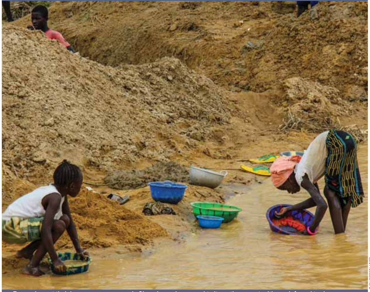
To supplement their income, many women in Sierra Leone have sought alternative opportunities as informal traders or artisanal miners. In 2008, it was estimated that in some areas up to 90 per cent of small-scale alluvial gold prospectors were women

Revisiting existing land tenure legislation such as the Devolution of Estates Act (2007)<sup>127</sup> will be necessary to enhancing protection for rural women working on family or chieftaincy-governed land, and improving women's empowerment in both agriculture and artisanal mining.