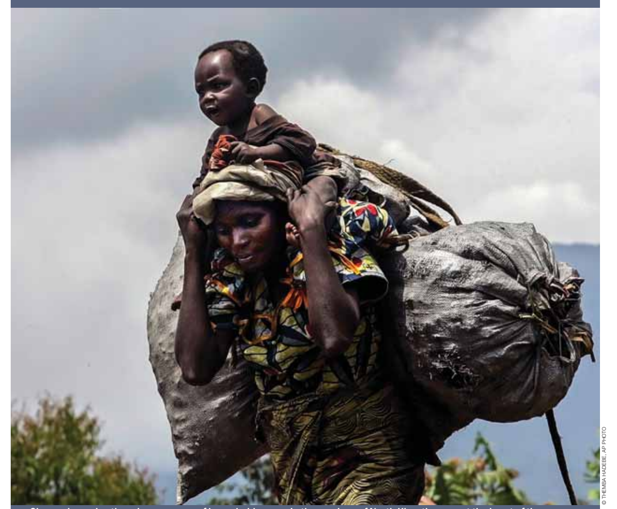
Case study 11. The perils of the charcoal trade in North Kivu, eastern Democratic Republic of the Congo

Charcoal remains the primary source of household energy in the province of North Kivu, the area at the heart of the protracted conflict in DRC. Making charcoal in the often remote forest exposes women to the risk of sexual violence