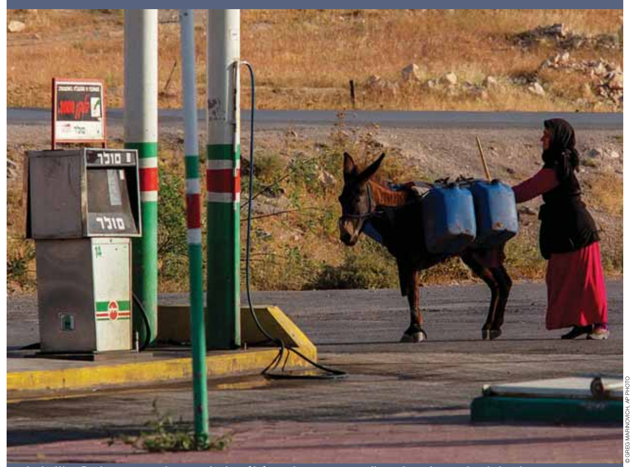
In the West Bank, women are key repositories of information on water quality and use. Leveraging their unique knowledge and skills could help improve water management systems