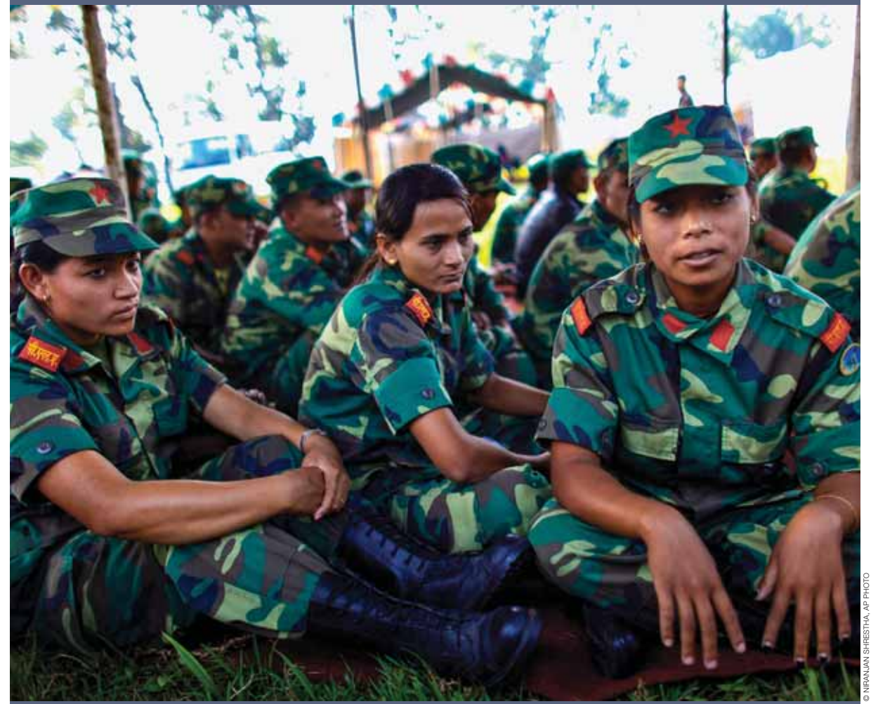
Case study 2. Safeguarding gender equality gains for ex-combatants in post-conflict Nepal

Former women Maoist rebels participate in an integration programme at Shaktikhor Cantonment in Chitwan, Nepal. While some have been integrated into the national army, many female ex-combatants rely on access to land in their communities to forge their futures