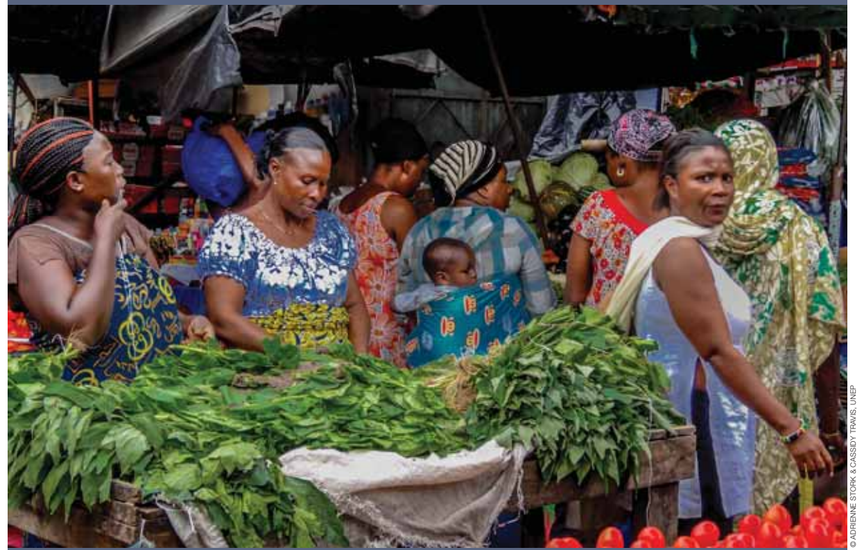
Despite the key role they play in food production and marketing, as seen here in Treichville, Abidjan, female farmers in Côte d'Ivoire rarely use microcredit schemes or government subsidies due to their limited access to technical training and inputs

The civil conflict that plagued Côte d'Ivoire between 2002 and 2011 is rooted in a mix of highly politicized land pressures and ethnic tensions. Open door immigration policies intended to encourage growth in key export sectors (mostly cocoa and coffee) led to the influx of migrants in the 1960s and 1970s, setting the stage for subsequent land conflicts between self-identified indigenous groups and those originating from the wider West African region. At the peak of the electoral crisis in 2011, approximately one million people were internally displaced and 200,000 Ivoirian refugees had fled the country.<sup>202</sup> Since the end of this crisis in April 2011, large numbers of land disputes – at times violent – have occurred, often exacerbated by the return of refugees and internally displaced people.