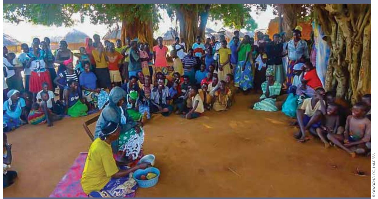
A sizeable crowd gathers to discuss women's land rights in Parwech, northern Uganda. Despite being responsible for growing 80 per cent of all food crops, only seven per cent of women in Uganda actually own land

Uganda has progressive constitutional and legal frameworks regarding gender. When it comes to women's land rights, however, both implementation and enforcement mechanisms are lacking. As a result, customs and practices that block women from exercising their land rights continue to prevail. One of the most significant issues in this regard is the inconsistent application of both customary and statutory laws protecting land rights. Competing land claims in the country are often linked to the multiplicity of land tenure systems – a legacy of colonialism that has been exacerbated by conflict.