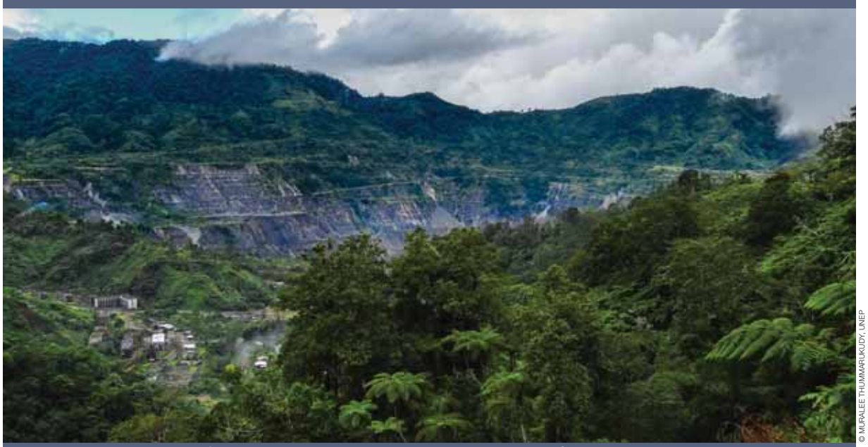
Case study 5. Women's roles in the peace process in Bougainville, Papua New Guinea

Women in Bougainville, PNG, spearheaded peace talks to end the bloody civil conflict that erupted over environmental contamination and the lack of equitable benefit-sharing from the Panguna copper mine