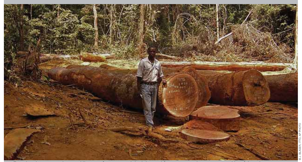
Ensuring that concessions and licenses for commercial mining and forestry operations are granted in a fair and transparent manner that yields benefits for local communities and the economy is a major challenge in peacebuilding

In addition, the Regional Certification Mechanism (RCM) adopted by the International Conference of the Great Lakes Region (ICGLR) in Africa, which covers major conflict minerals, has included women, peace and security considerations insofar as to recognize the high levels of rape and other sexual violence towards women around militarized mining areas.<sup>105</sup> At an implementation level, the RCM identifies the need for: consultations with women's groups; strategies for the improvement of the conditions of women working in the mine's area of influence; and guaranteed protection of fundamental women's rights. These are listed as "progress criteria" for certification applicable to both artisanal and industrial mining. However, these criteria are currently only monitored for the purposes of certification, with the view that ICGLR Member States implementing the RCM will one day develop and/or demonstrate the will and capacity to enforce such criteria and shut down mines and/or exporters when these criteria are not met