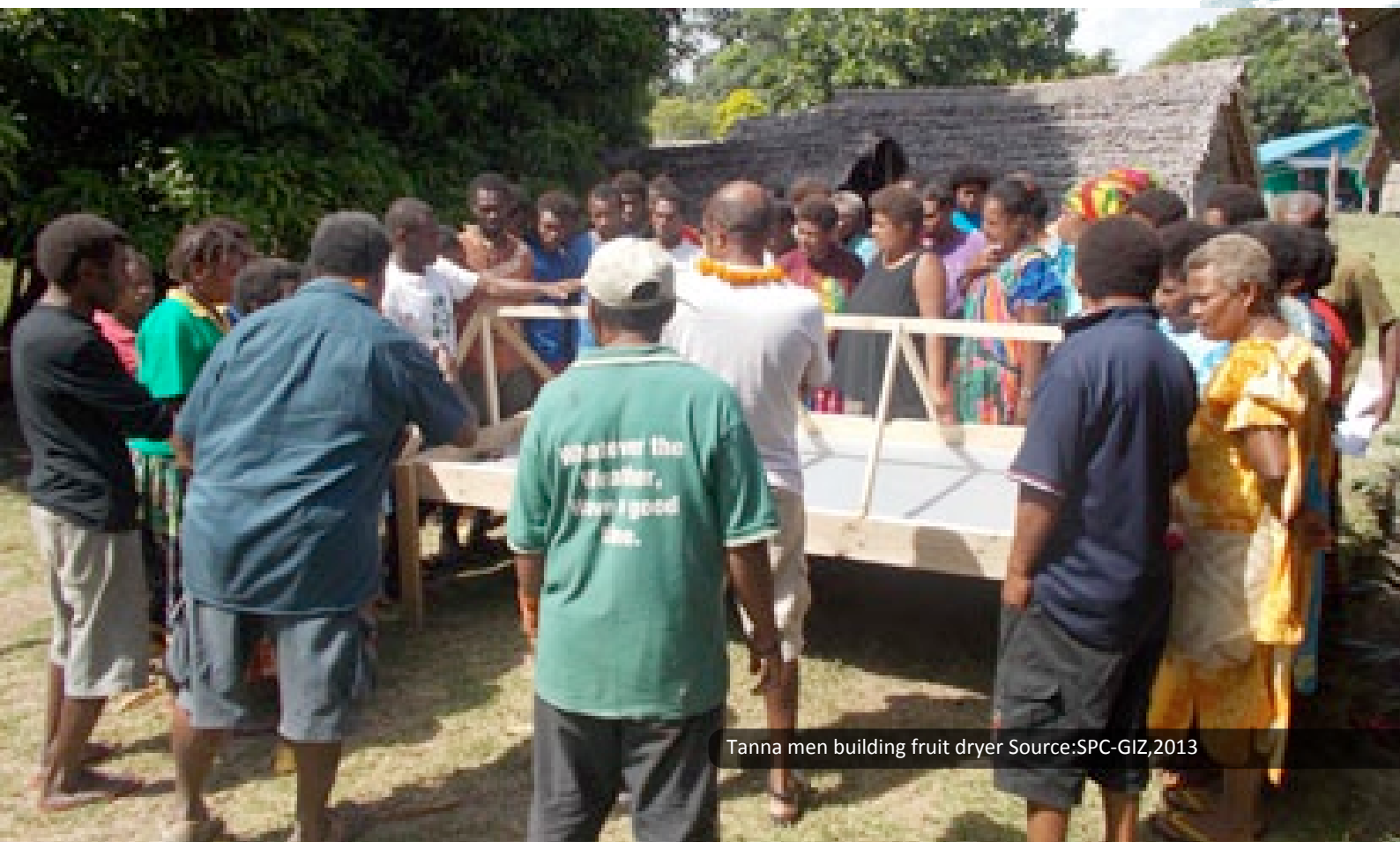
Tanna men building fruit dryer

An example of how gender can affect vulnerability to climate change is where a woman cannot attend training about climate change impacts because she is expected to cater for the training with other women). This limits the information she can access to help her make decisions on how best to manage climate change impacts. Another example is the expectation within a society that a man's role is to provide for his family. If an event causes major losses in the main cash crop that men produce to make money for their families, they may feel significant stress, burden and social pressure to find another way to make money. In both cases, these roles (preparing meals, and generating family income) are not 'natural'; they are based on the society's expectations of what men and women can and should do.