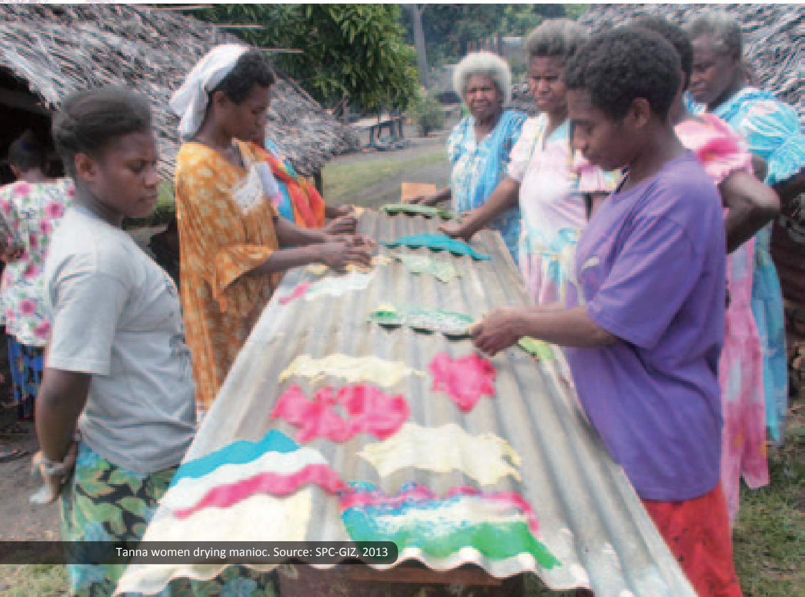
Tanna women drying manioc.

Programmes that are aimed at strengthening food security and building resilience to climate change must allocate resources and provide services to both women and men. Information, technology, training and investments for food security must be equally accessible for women and men and customised to address their respective needs.