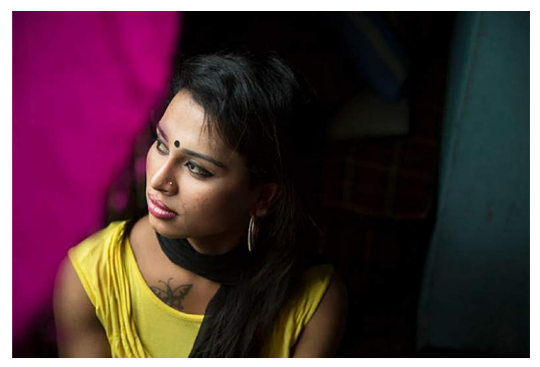
Above: Bangladesh. A transgender woman poses at her home.

Due to the availability of other resources, the Toolkit does not cover issues of transitional justice, which involve Truth Commissions and various forms of national and international criminal courts and investigative processes.<sup>36</sup>