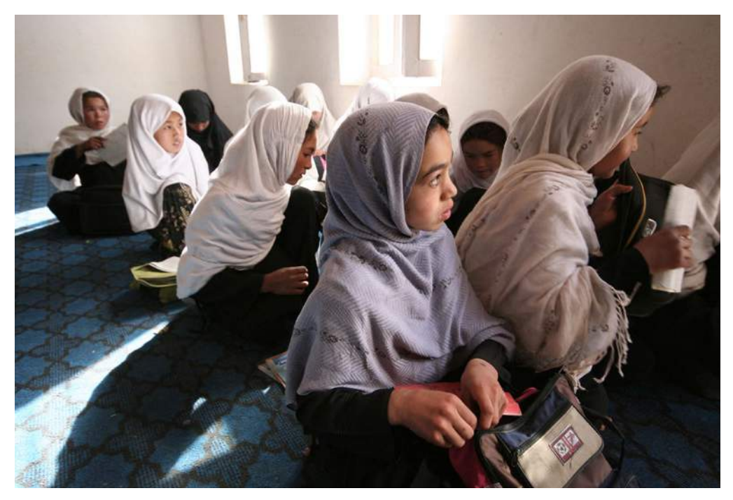
Above: Afghanistan. Students in a classroom.