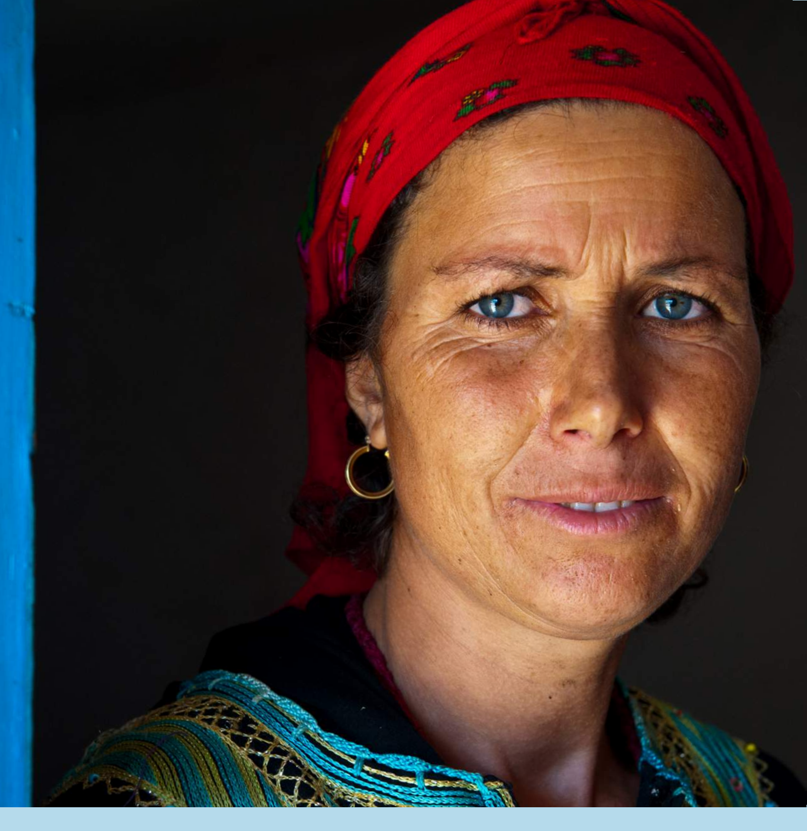
Above: Tunisia. A pottery artist based in Senjane.