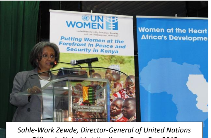
Offices in Nairobi at the Kenya Open Day 2012

UN Women in collaboration with the Embassy of the Republic of Finland in Nairobi and the National Gender and Equality Commission (NGEC) held a practitioners' conference, themed 'Best practices: Women, Peace & Security Interventions' on 12 September 2012 and a 'High