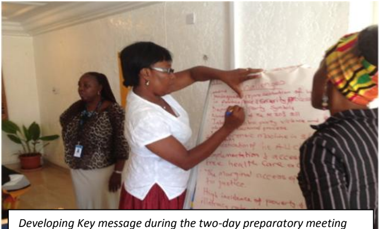
Developing Key message during the two-day preparatory meeting in Sierra-Leone, 18-19 September 2012

regions, which helped to ensure a truly national dialogue among women from a broad spectrum of society. In most of the larger UN missions the events included a workshop lasting one to three days, involving presentations, debates and group work. For instance, in Timor-Leste the participants of preparatory workshops worked in thematic groups focusing on justice, security, socioeconomic concerns, and women's participation to ensure that all relevant issues and concerns were integrated into the Open Day dialogues. Where available, the presence of expert resource persons at preparatory workshops provided for a