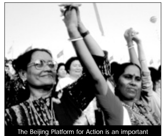
reference point for women leaders and peace activists from around the world.

The platform reiterates the need to protect women in situations of armed conflict in accordance with the principles of international human rights and humanitarian law, and recognizes women's roles in caring for their