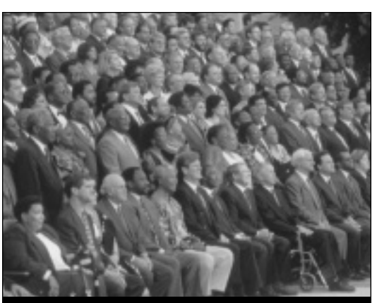
The adoption of positive action programmes in the new South Africa is widening the space for women to participate in charting the country's development.

The ministry is also drafting a proposal to create a new National Council for