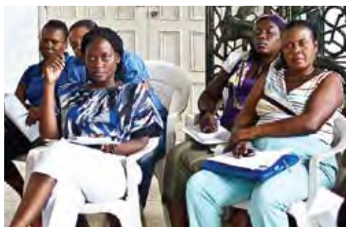
Open Day on Women, Peace and Security. Haiti, 2010