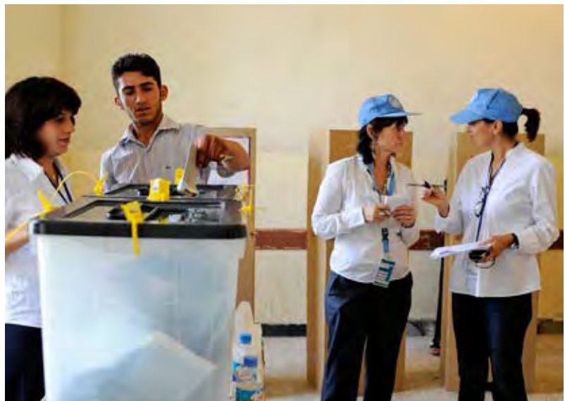
Voters exercise their constitutional right in Kurdistan region of Iraq. UN Photo/Rick Bajornas 2009

The women requested the UN support in several areas including political participation and enhancement of women’s decision making roles, engagement in peacebuilding, supporting the State Ministry of Women’s Affairs (SMOWA) and the establishment of the higher commission for women, and in the areas of protection and violence against women, technical support, capacity building, advocacy, and economic security.