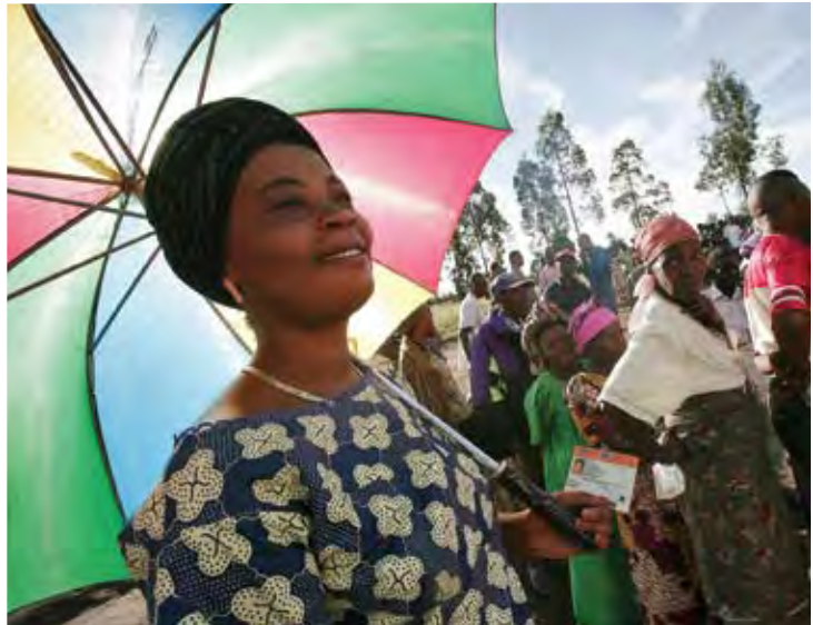
Congolese women queue up outside the polling center in the "Muzipele quarter" in Bunia, Ituri, to cast their ballots in the second round of the presidential and provincial elections of the Democratic Republic of the Congo. UN Photo/Martine Perret 2006

Speaking at the event, SRSB Alan Doss called on the government of the DRC to ensure the respect for gender-based quotas in the design, implementation and evaluation of policies, especially in domains targeted by the Programme d'Action Prioritaire , as a hallmark for the building of sustainable peace in the DRC.