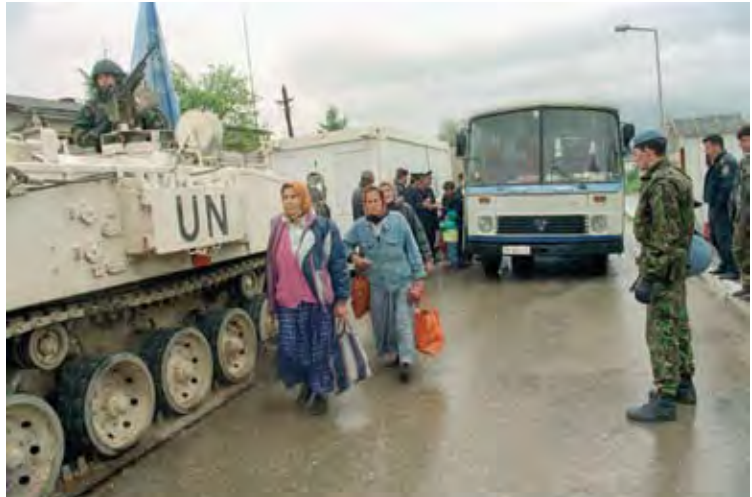
Soldiers of British battalion monitor the movement at a UN checkpoint. UN Photo/John Isaac 1994

The international community in Bosnia and Herzegovina needs more information about resolution 1325 (2000) and the other resolutions on women, peace and security (resolutions 1820 (2008), 1888 (2009) and 1889 (2009)). The work that NGOs have done together has helped to make the international actors in Bosnia and Herzegovina more accountable and now gender is included in all international actors' programmes including those on civil society building, education, employment, the Roma, SGBV, and women in politics. The UN RC was also interested to learn more about a national outreach campaign on women's security, human rights and small arms.