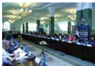
Open Day on Women, Peace and Security. Tajikistan/Central Asia, 2010