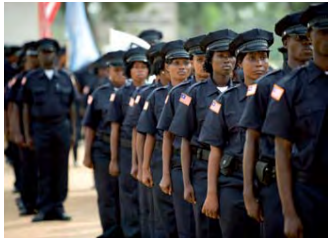
The thirty-third class of police officers of the Liberian National Police (LNP) participate in a graduation ceremony. UN Photo/Christopher Herwig 2009

The UN system will continue to be guided by the Liberia National Action Plan on resolution 1325 (2000) and CEDAW in the reconstruction and development programmes it supports and implements.