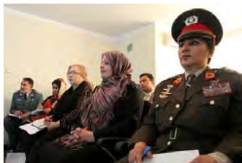
The 2010 Open Day on Women, Peace and Security. Afghanistan, 2010