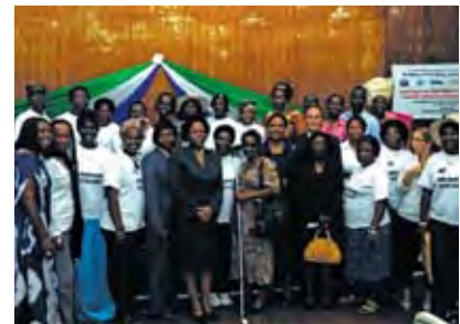
Open Day on Women, Peace and Security. Sierra Leone, 2010

Since resolution 1325 (2000) was passed ten years ago, some progress has been achieved. In many post-conflict countries, the number of women in government has increased dramatically, quotas have been set and implemented, and women have used their public decision-making roles to advance women’s rights. There is increased awareness of gender differences in the impact of conflict, and this is reflected in post-conflict needs analyses and planning frameworks. Still, significant gaps remain. For instance, while there is an increase in the extent to which peace agreements address gender issues, only 16 per cent of peace agreements contain specific provisions on women’s rights and needs. 1 While gender analysis is found in post-conflict needs assessments, less than 8 per cent of proposed recovery budgets identify spending priorities addressing women’s needs, 2 and just 5.7 per cent of actual spending in multi-donor trust funds is allocated to initiatives to build gender equality or promote women’s empowerment. 3 Post-conflict employment generation programmes have not sufficiently targeted the most vulnerable groups, including female heads of household and impoverished women, and investment in women’s property rights and livelihood prospects is inadequate. Sexual and gender-based violence is rampant in some conflicts and often continues unabated after peace deals are settled.