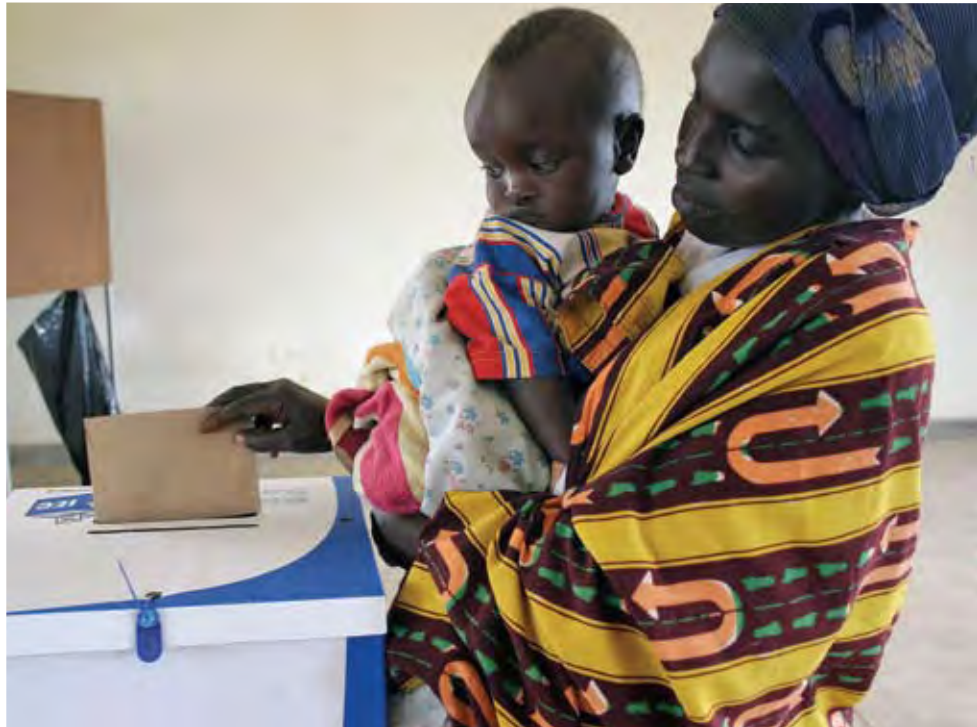
ONUB facilitates the national referendum in Burundi 2005

The ERSG pledged the United Nations' technical, material and financial support to women's actions for peace in Burundi. He stressed the need to create an environment that ensures that peace consolidation is achieved through democracy and the peaceful resolution of conflicts and electoral disputes in accordance with the various peace agreements. He expressed his commitment to support women in their efforts to prevent violence and conflict related to the 2010 elections in Burundi.