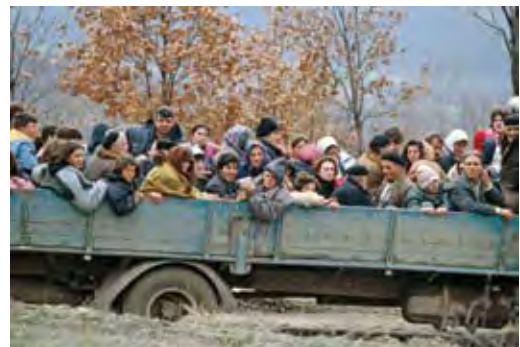
Kosovar refugees fleeing their homeland.

The UN also acknowledged the need for more women in key decision-making positions to ensure an equal voice in all issues of public policy. The SRSG assured the gathering that he will pass on the concerns and recommendations of the women to the Secretary-General to assist in targeting UN programming in the region.