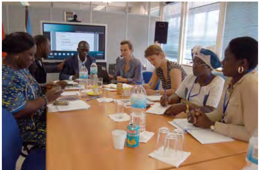
Open Day on Women, Peace and Security, Guinea-Bissau, 2010

of assistance have included the capacity development and sensitization of the Parliament and the Women's Political Platform; efforts to improve access to justice, for the poor and for women in particular, through legal aid clinics and in terms of the government's budget allocations to the social sector. An important exercise being conducted at present is the mainstreaming of gender within the Poverty Reduction Strategy Paper (DENARP II) process. Finally, the RC called upon the women peace activists and government representatives present to take leadership in pushing for these policies and initiatives and their implementation, reinforcing the commitment of the UN system to continue support to such national efforts.