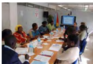
The 2010 Open Day on Women, Peace and Security. Guinea-Bissau, 2010