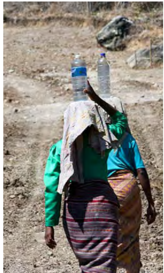
Women work on UN project in Timor Leste. UN Photo/Martine Perret 2007

Reports on gender and the security sector, gender and transitional justice, and women's participation in decision-making and peacebuilding were presented, based on the pre-Open Day consultation held on 26 May at the UN compound. Many of these recommendations are already being acted upon by concerned national authorities with support from the international community including the UN. For example, the recommendation to sustain the participation of women in community-level mediation and peacebuilding activities is something that UNDP and the Ministry of Social Solidarity have been planning under a new project to establish a Department on Peacebuilding and Social Cohesion. Another recommendation, to make gender sensitivity an essential outcome of police training, and to provide the tools to conduct such work properly, is already being handled by the United Nations Mission in Timor-Leste, UNIFEM (now part of UN Women), UNFPA and UNICEF. A training manual that integrates all of these aspects was launched in June 2010 although the training has been carried out since February 2010.