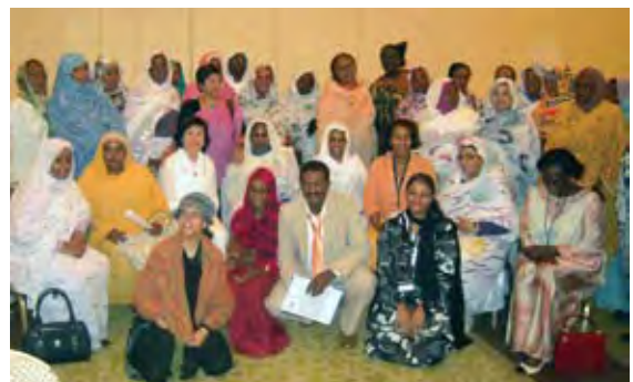
Open Day on Women, Peace and Security. Sudan, 2010

Finally, women voiced the need for a mechanism for accountability to carry out and measure the implementation of resolution 1325 (2000). The women of Central Asia who met in Tajikistan stated, “Resolution 1325 (2000) will not be implemented unless a clear accountability mechanism in the form of a mandatory reporting on the implementation of the resolution 1325 (2000) is introduced by the United Nations Security Council for the member states.”