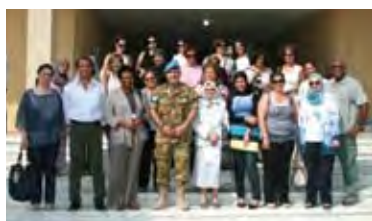
The 2010 Open Day on Women, Peace and Security. Lebanon, 2010