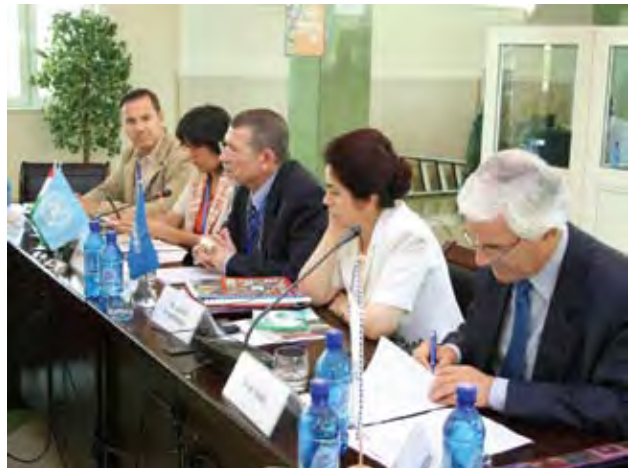
Open Day on Women, Peace and Security. Tajikistan, 2010

Ambassador Ivar Vikki, Head of the OSCE Office in Tajikistan, acknowledged that there is much work ahead in moving toward full implementation of resolution 1325 (2000), saying, "we are only at the beginning of this hard and steep path and there is a clear need for concerted actions and close cooperation for setting up national and regional mechanisms to successfully implement the commitments stated in resolutions 1325 (2000) and 1820 (2008). On behalf of the OSCE I reiterate our readiness to jointly support the implementation of these important commitments."