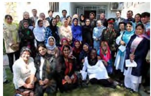
Open Day on Women, Peace and Security. Afghanistan, 2010

In his response, SRSG Staffan de Mistura acknowledged the clarity of the messages and their relevance to the situation in Afghanistan. He expressed hope that the Open Day would be a stepping-stone towards real change in Afghanistan. He concurred with a proposal to use the provisions in the Afghanistan Constitution that protect the gains made by women in terms of participation in governance, politics and decision-making and safeguard their human rights. The SRSG further advised the women that their messages should be strategic, uniting all Afghans, and should focus on issues that are current at any point in time. He stressed that the most current issues relate to the forthcoming parliamentary elections in Afghanistan. He advised the women to actively participate in registering as voters, support female candidates, and vote for those candidates that support gender equality and the advancement of women.