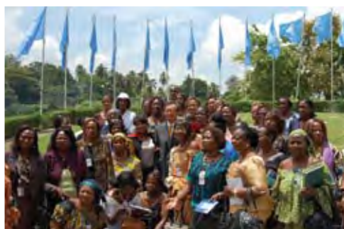
Open Day on Women, Peace and Security. Côte d'Ivoire, 2010

In short, the forums highlighted the need for UN in-country leaders and women peace leaders to build partnerships to advance the mutual goal of bringing sustainable, inclusive peace.