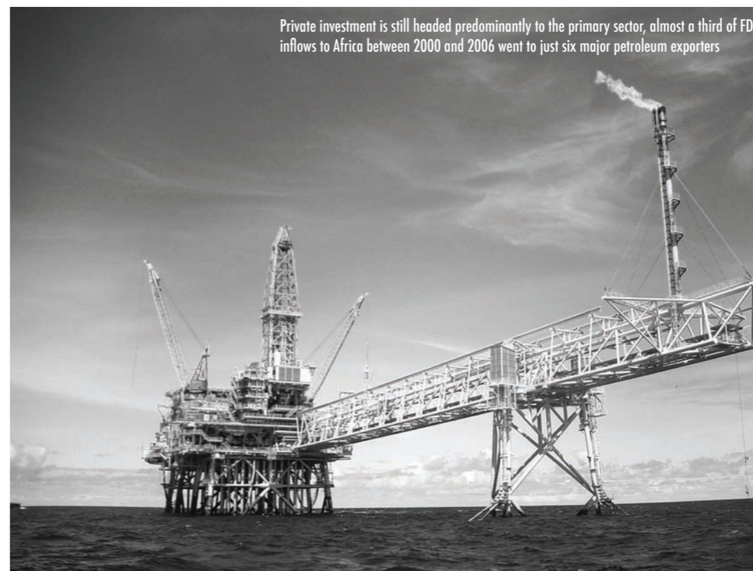
Private investment is still headed predominantly to the primary sector, almost a third of FDI inflows to Africa between 2000 and 2006 went to just six major petroleum exporters

It should thus not be taken for granted that the private sector will succeed in tackling adaptation challenges, particularly since in the past it has, on the whole, failed to alleviate poverty and livelihood threats in many of the poorest parts of the world. More robust analysis is needed of what the private sector might actually contribute towards adaptation efforts – both what this contribution will look like and who will benefit. ■