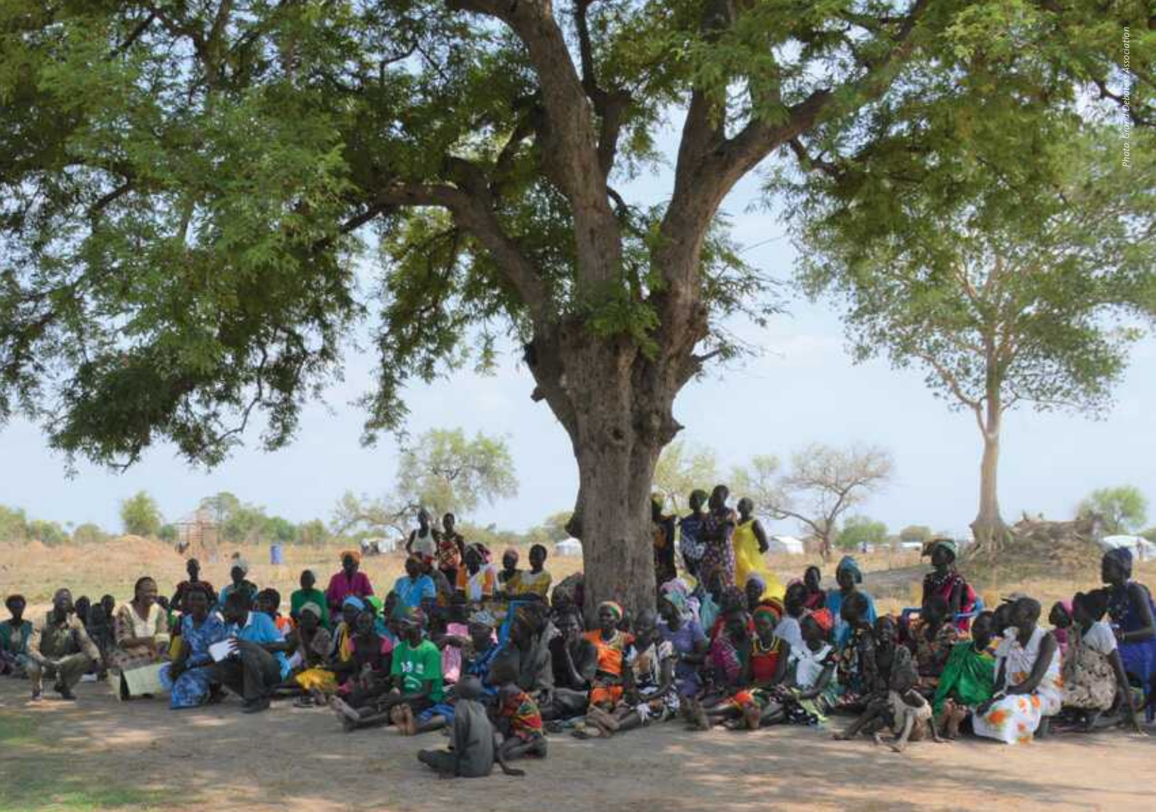
Under the Tree Dialogue with women on ending gender-based violence in Mingkaman, South Sudan.