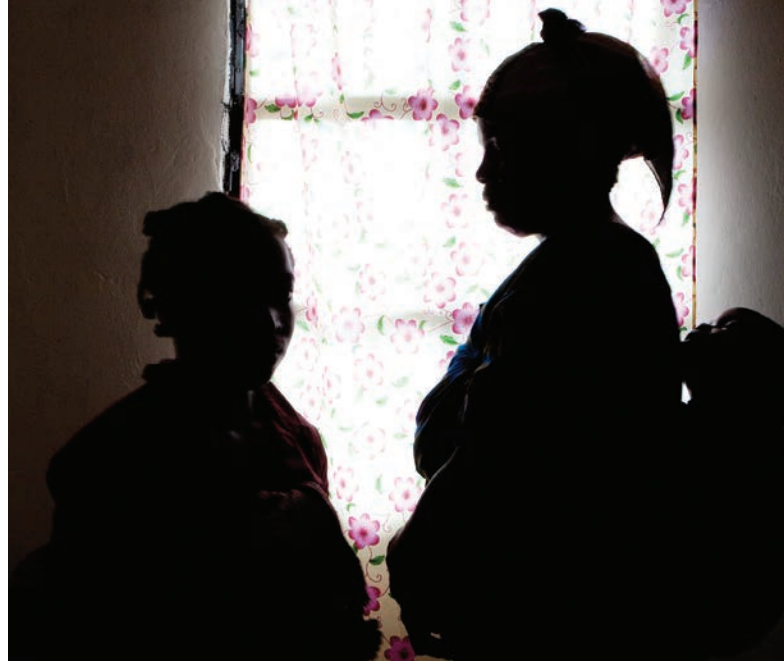
A women's shelter for victims of sexual abuse in Goma.

While governments offer humanitarian assistance to displaced communities and to limited categories of victims, they are often reluctant to provide reparations, which would mean acknowledging the right of a potentially larger number of victims to material (and symbolic) benefits involving a wider range of losses