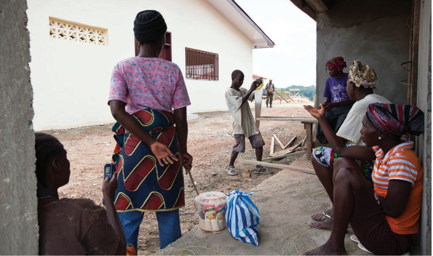
A Justice and Peace Hub under construction in Gbarnga, Liberia. The new initiative is being funded by the UN Peacebuilding Fund.