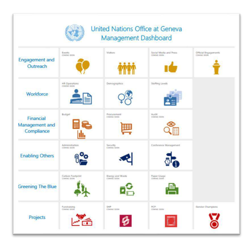
The Gender Management Dashboard of the United Nations Office at Geneva (UNOG)