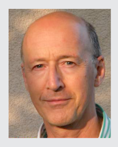
EXPERT'S VIEW Simon