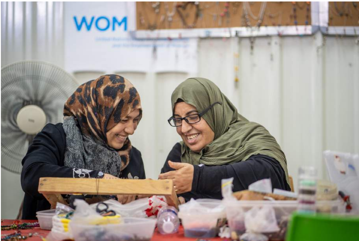
Syrian refugee women in Jordan Zaatari camp.