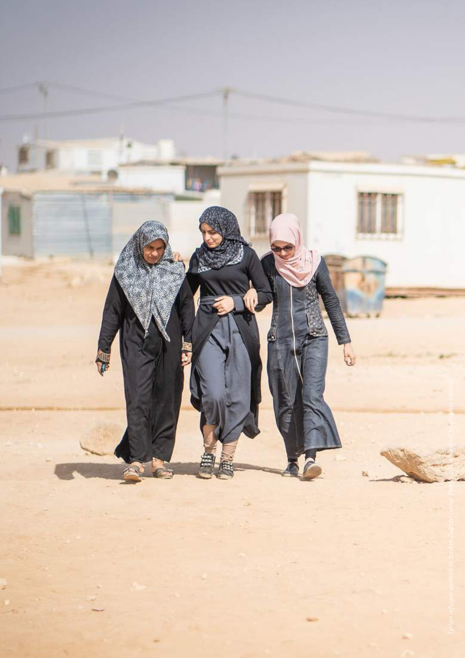
Syrian refugee women in Jordan Zaatar camp.