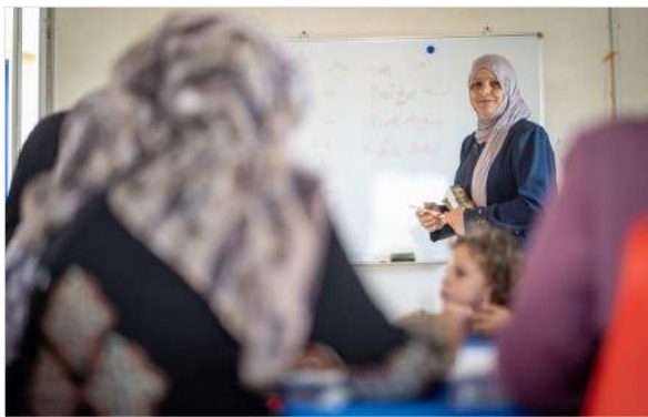
Syrian refugee women in Jordan Zaatari camp.

Many participants expressed the need to clarify or redefine key concepts – such as ‘martyrs’, ‘Jihadism’, ‘radicalization’ and ‘violent extremism’ itself – and the need for evidence- and gender-based approaches. They emphasize that there are risks of human rights violations when terms like ‘extremism’ or ‘radicalization’ are applied to non-violent activity. In this regard, participants suggested that regional comparative studies in the field could be useful.