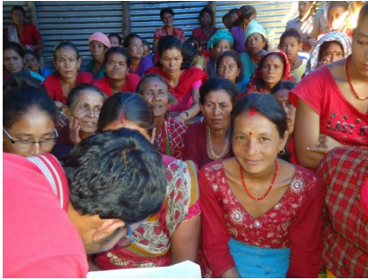
Information volunteer disseminating information at Salyantaar, Dhading, Nepal.