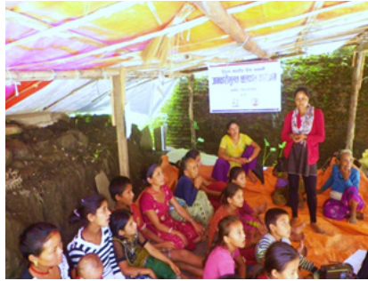
Information volunteer disseminating information at Jalbire, Sindhupalchowk.

■ Women have particular and unique needs in terms of their health and hygiene that must be considered, this includes both sanitation and cooking/kitchen facilities; a number of organisations are planning to include cleaner and more efficient stoves in their building project plans.