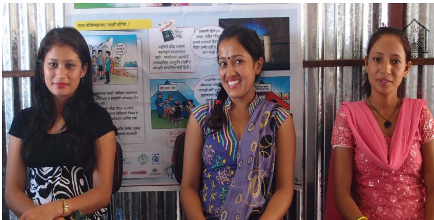
Multi Purpose Women's Centre, Sindhupalchowk.

Three young girls who had come to the Multi-purpose Women Centre in Sindhupalchowk run by Saathi to receive psychosocial group counselling, said that they wish relief and recovery programmes would target young girls not only as beneficiaries but also by involving them as contributors and active participats in all stages of the humanitarian response. They stressed that “if given the skills and training, we young girls are able to do any kind of recovery and rebuilding work efficiently!”