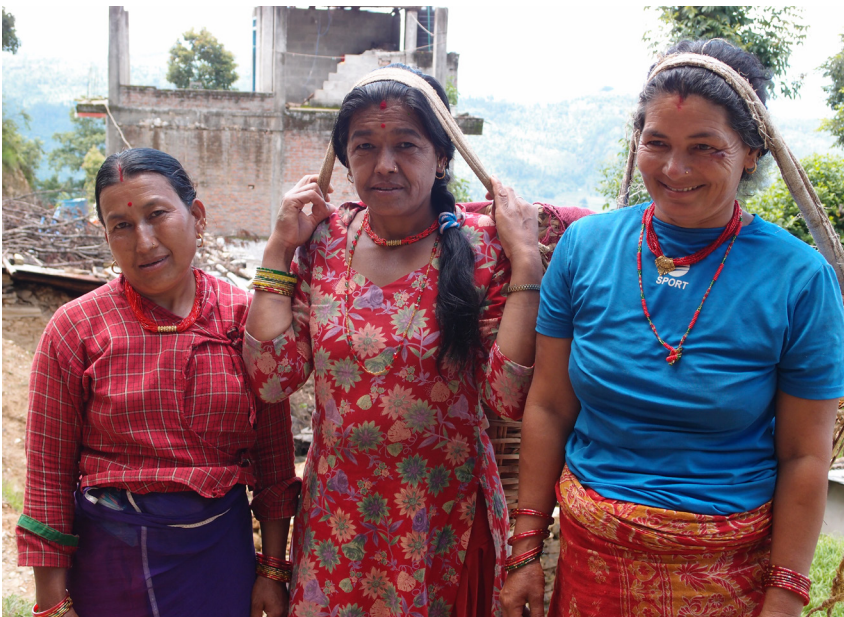
Women explaining they have to walk further to collect water after the earthquake and walk two hours. Malechore, Sindhupalchowk

The Post-Disaster Needs Assessment Vol. B: has been made public in early August. Volume B includes detailed information on each of the 23 sectors analysed and supplements and elaborates further on the PDNA Volume A: Key Findings, which was published in mid-June. Gender Equality was mainstreamed throughout the PDNA and a separate chapter on Gender Equality and Social Inclusion was included in both Volume A and B of the final report. The key highlights on Gender Equality and Social Inclusion in the Volume B report, presented as elaborations of the key findings presented in the PDNA Vol. A, are as follows.