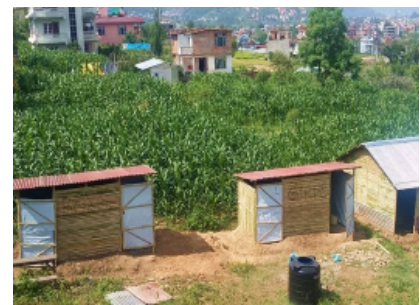
Separate Temporary Toilet & Urinals for girls & boys (Vidhyamandir Se. School, Naikap, Kathmandu).