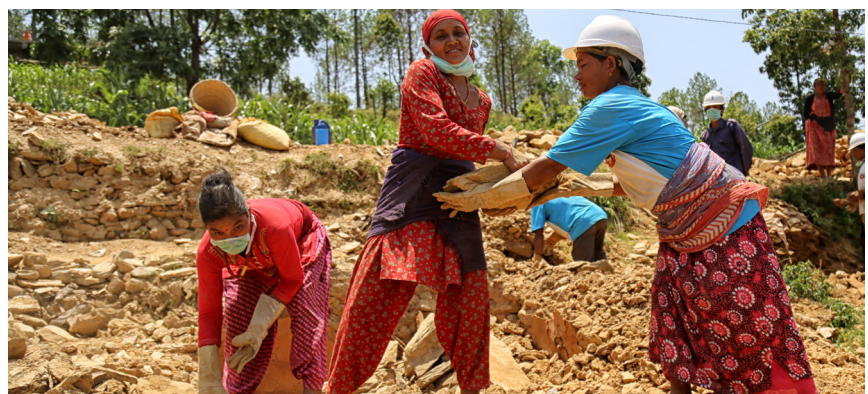
Women engaged in Cash for Work Debris Management.

An estimated 57,300 households (of 35,000 households targeted in Flash Appeal) have benefitted from safe demolition and debris removal. Composition of the households has been recorded during the assessments. The data is currently being digitalized. Currently debris removal is focusing on public buildings including health and education facilities. More people are benefitting from restored access to services, while the cash for work modality will not reach as many individuals as planned in line with current demand. 5,800 people (of 85,000 targeted in Flash Appeal) have been employed in Cash for Work modality in support of debris removal