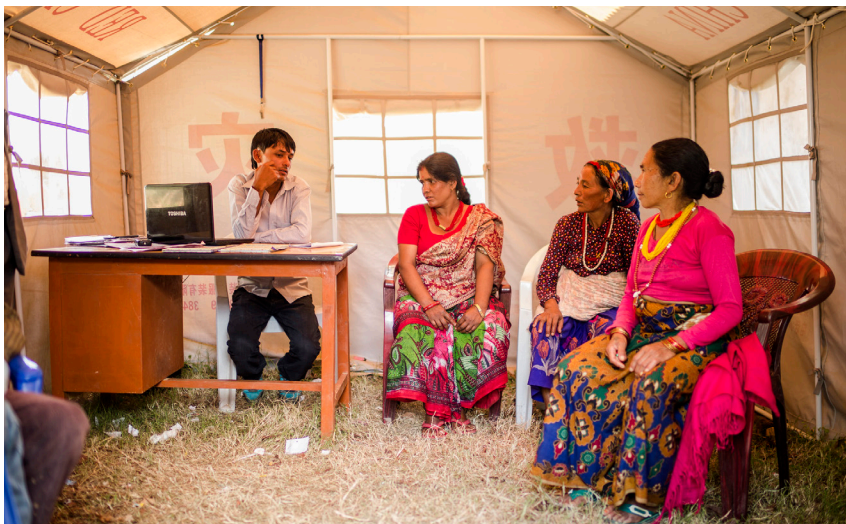
Women seeking relief and recovery information from District Information Desk, Sindhupalchowk.

in the country's path to recovery (while seeking to improve protection against their trafficking and exploitation as migrant workers). Recovery also represents a short-term opportunity to kickstart and restore rural livelihoods as well as promote women's economic empowerment.