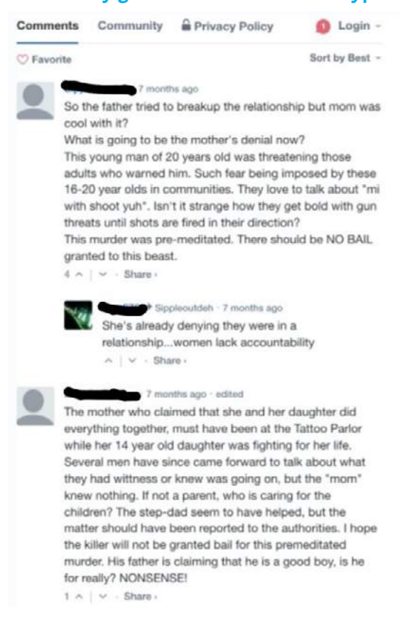
Figure 1: Snapshot showing the media reporting - audience interpretation dynamic and its linkage with the perpetuation of discriminatory gender norms and stereotypes.

Media framing analysis leverages both a broader gender analysis, as well as considerations related to how gender and other norms, as well as GBV, manifest in a particular context. For instance, references to substance use, the clothing worn by a victim, or suggestions pertaining to sexual activity are widely acknowledged as contributing to the dehumanization of GBV victims everywhere; whereas context specific references might be the use of 'marera' to refer to a victim of femi[ni]cide in Central America, which would suggest to the audiences that the victim was involved with/linked to gang members (see Fuentes 2020a). As an example of the dynamic between story framing and interpretation by the readers, see Figure 1. We note that framing of the story implied blame on the mother of the victim, and readers comments show that indeed, and inadvertently the blame was shifted from the perpetrator to the mother of the victim, "mother was cool with it", and perpetuated gender biases like "women lack accountability."