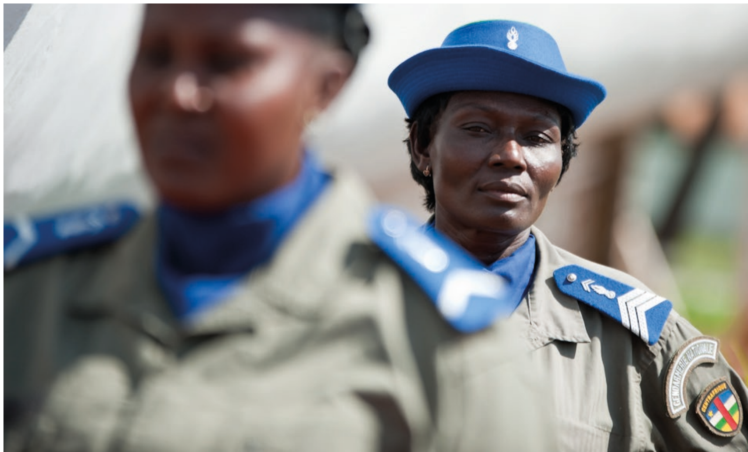
Members of the national gendarmerie in the Central African Republic.

Additionally, in 2021, the Women, Peace and Security and Humanitarian Action Compact was created as an inter-generational, inclusive movement for action on women, peace and security and gender equality in humanitarian action. The Compact framework assembles existing commitments related to the WPS agenda and sets out key “actions,” to which States, United Nations entities, regional organizations, civil society, academic institutions and the private sector may commit, in order to close implementation gaps. The Compact includes an action to “strengthen the capacity of national rule of law institutions, the security sector, and national human rights institutions in an inclusive and survivor-centered manner, including through women’s meaningful participation in the design, implementation, monitoring and evaluation of these capacity measures.” 11