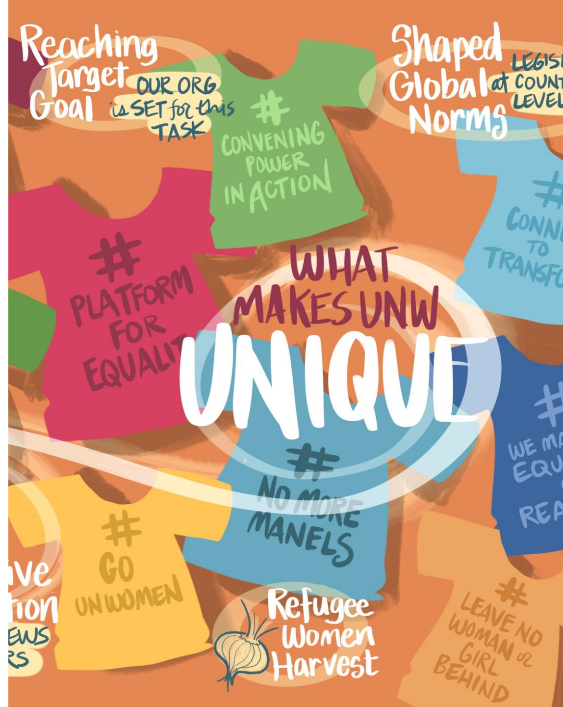
Photo | Graphic Visualization from 2021 Global Consultation Workshop for the current SP