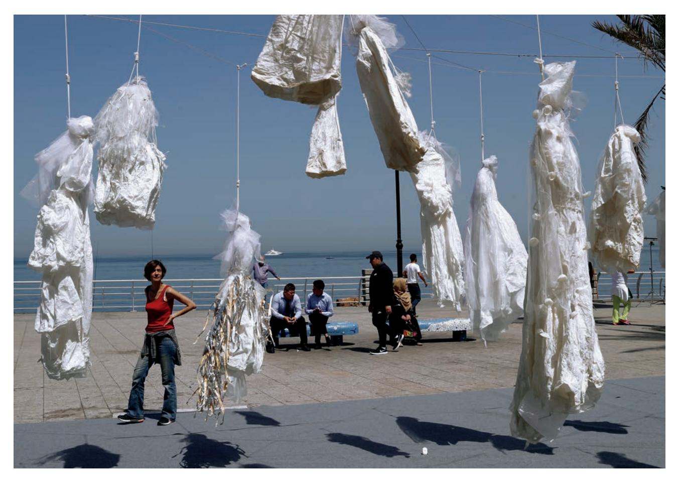
Sometimes a dress speaks louder than words. Women's activists in Beirut, Lebanon strung up white wedding dresses in a striking protest against a longstanding law allowing a rapist to go free if he marries his victim. The movement quickly gained momentum, resulting in abolishment of the law.

Violence against women and girls remains so pervasive that ending it is everyone's concern. More and more people, from all walks of life, have recognized they must get involved. UN Women engages with legislators to pass tougher laws, business owners to make work-places safe from harassment, and statisticians to improve data so that violence is no longer an invisible crime. All of them are activists committed to a safer, more just world. Behind them are millions of women who have stood up and said enough is enough. We have a right to live free from violence. The time is now.