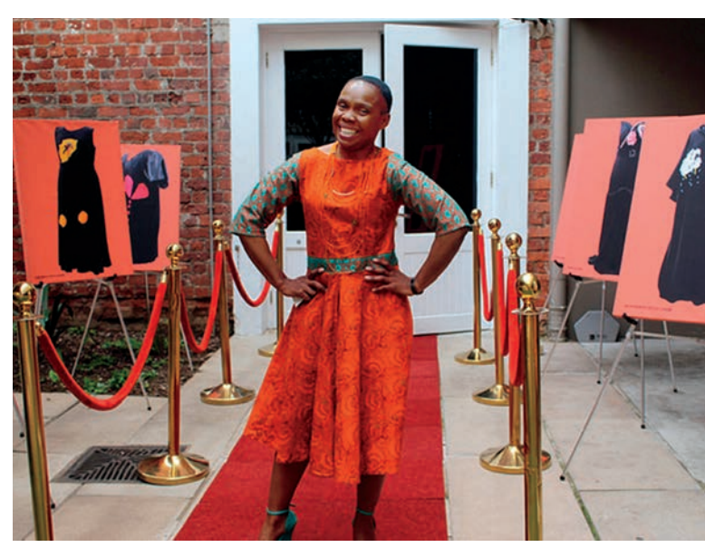
For the 16 Days of Activism against Gender-Based Violence, the world went orange, the signature colour of the UN Secretary-General's campaign UNiTE to End Violence against Women by 2030. Clockwise from top left: The orange-illuminated presidential palace in Quito, Ecuador; a flashmob in Ukraine; a public rally to take action in the United Republic of Tanzania; an all-women football match in Turkey; slogans against violence in Morocco; luminaries from the arts and media at United Nations headquarters to launch the Days; violence survivors showing off new fashion design skills in South Africa; orange handprints signalling commitment to the cause in Bangladesh; and a painting contest for children and youth in Viet Nam.