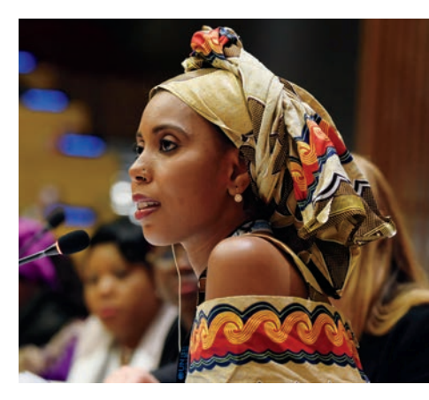
The annual UN Commission on the Status of Women is a chance for women from around the globe to galvanize continued action to achieve gender equality. They come with diverse concerns, from equality in nationality laws to balanced gender portrayals in the media, from more equitable economies to parity in politics. But their overall goal is the same: a world where all women are empowered, and gender equality is the norm everywhere, not the exception.