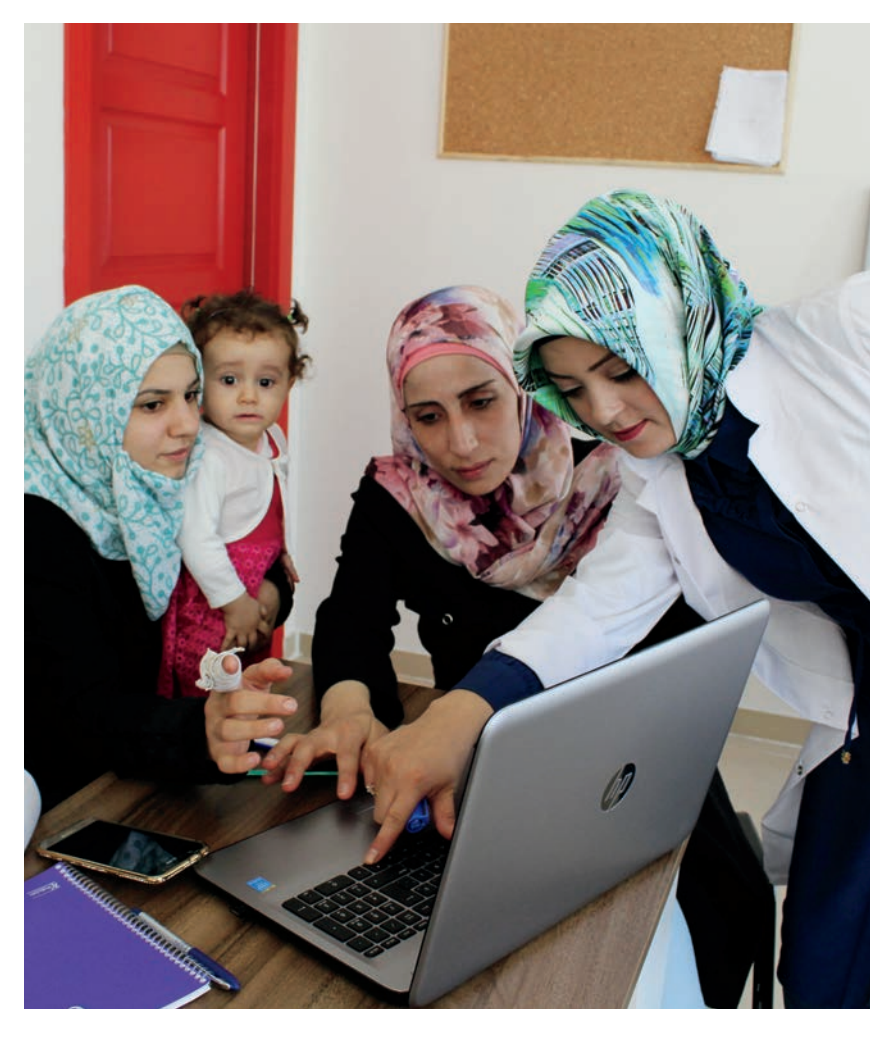
At the SADA Women-Only Centre in Gaziantep, Turkey, Syrian refugees and women from local communities attend computer courses. It is a chance to learn new skills and build closer relationships.

groups see how they can act to claim women's rights. The Commission itself has now committed to upholding these rights at every point in the long journey of healing the wounds of the past.