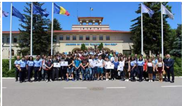
Highschoolers at the Hofigal production center and the „Alexandru Ioan Cuza” Police Academy

On the 18 th of June, several hundreds of people, between 8 and 69 years old, attended the „Equal opportunities cross-country race” in the „Alexandru Ioan Cuza” Park, Bucharest.