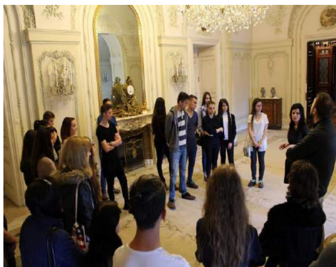
High school students visiting the Cotroceni National Museum

https://www.youtube.com/watch?v=JLT8SxbVbt8&feature=youtu.be