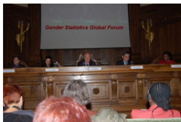
1 st Rome, 2007