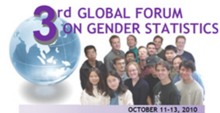
3 rd Manila, 2010