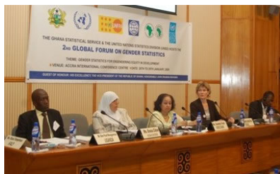
2 nd Accra, 2009