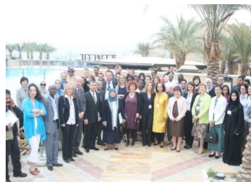
4 th Dead Sea, 2012