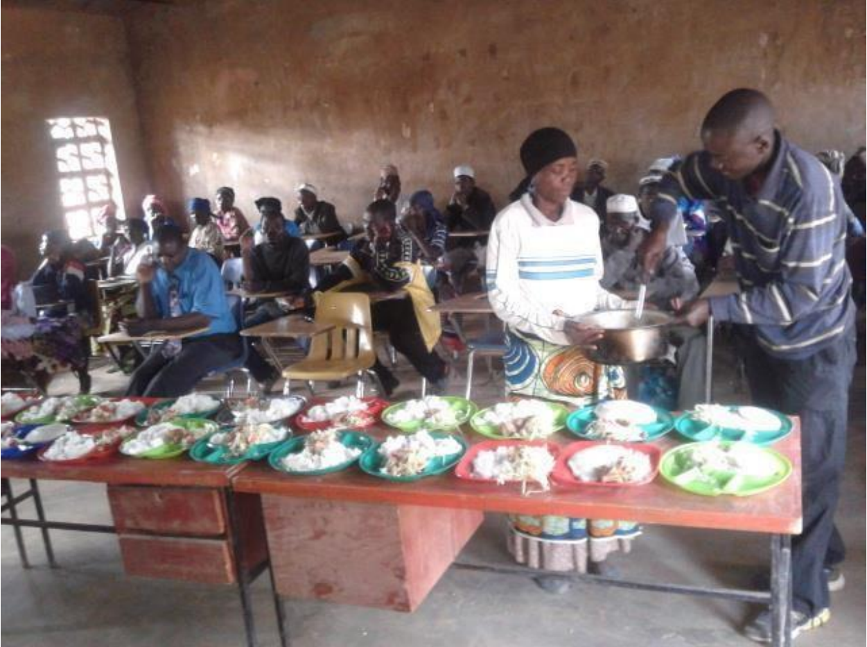
Man and woman serving food at a farmer-led food day