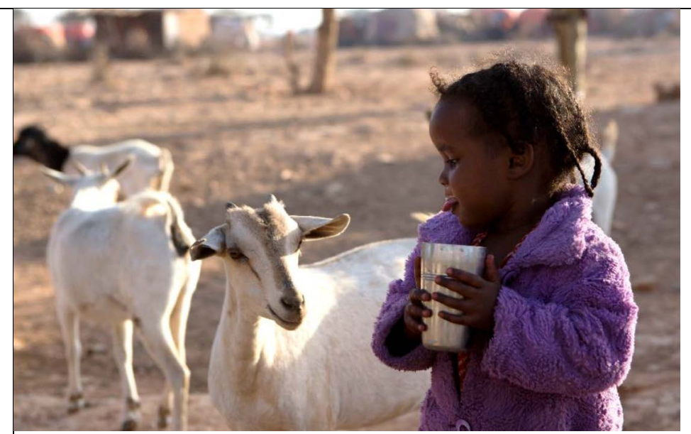
QARDHO, PUNTLAND Milk from surviving goats is helping displaced pastoralist families feed themselves.