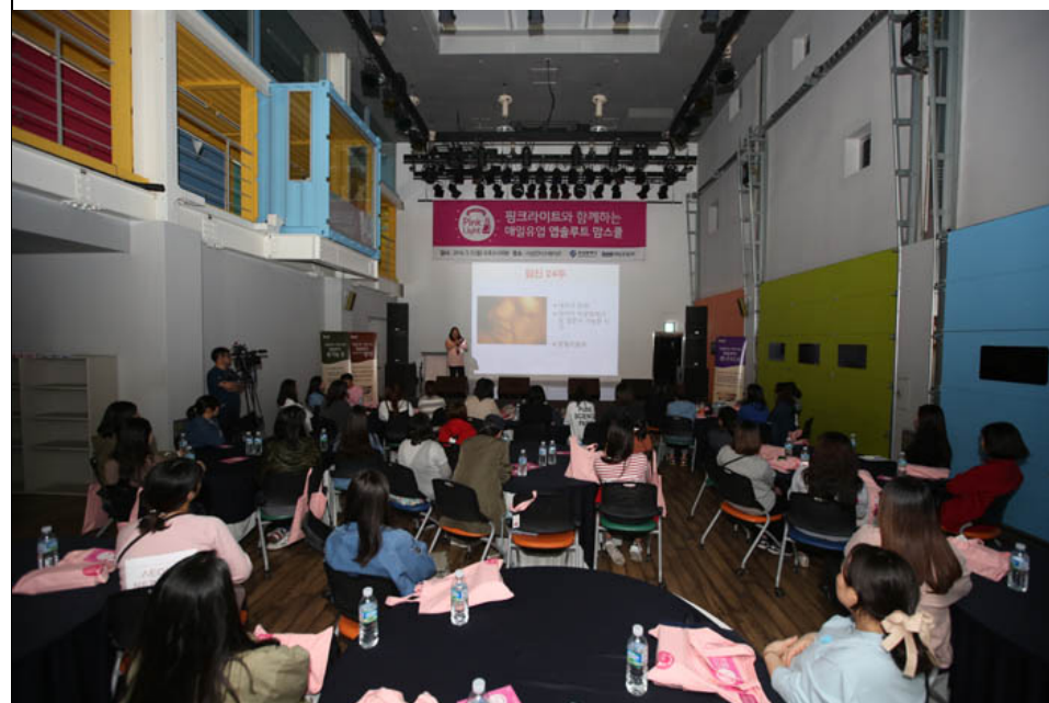
Maeil Dairy, Korea's largest dairy company, hosted a prenatal class in collaboration with the Pink Light project