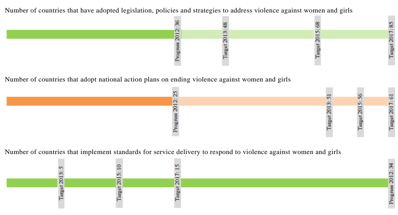
Figure IV Ending violence against women: trajectory of progress towards the target

through evidence-based advocacy and by opening policy spaces to amplify the voices of women. National action plans to end violence against women were approved in six countries supported by UN-Women, <sup>16</sup> and new or amended legislation on various forms of violence was passed in 15 countries supported by UN-Women, <sup>17</sup> including on sexual harassment in the workplace, domestic violence, femicide, acid violence and sexual offences. In Viet Nam, for example, the Government included two new domestic violence targets in the Family Development Strategy 2020. In Kyrgyzstan, UN-Women contributed to amendments to the criminal code on increasing punishment for bride kidnapping. In Sierra Leone, following UN-Women support to national advocacy efforts and capacity development, the Government enacted the Sexual Offences Bill, responding to the concerns of gender advocates and women's associations that existing legislation was inadequate. The new law raises minimum jail sentences from 2 to 15 years.