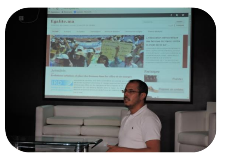
Supporting civil society's advocacy efforts for legislative change and its role in monitoring and evaluating public policies