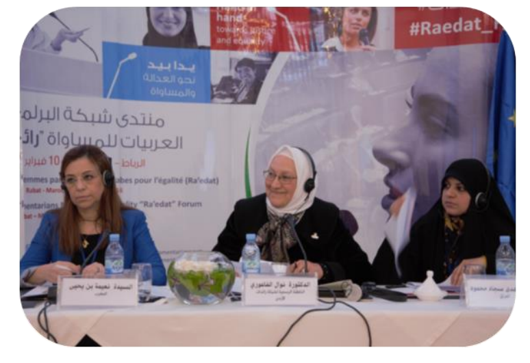
Strengthening institutional accountability towards gender equality