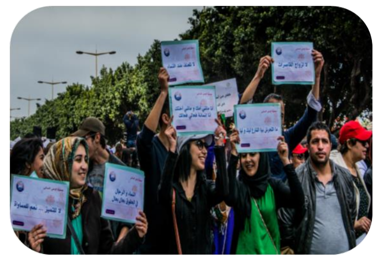
Harmonizing national legislation with the 2011 Constitution and international norms