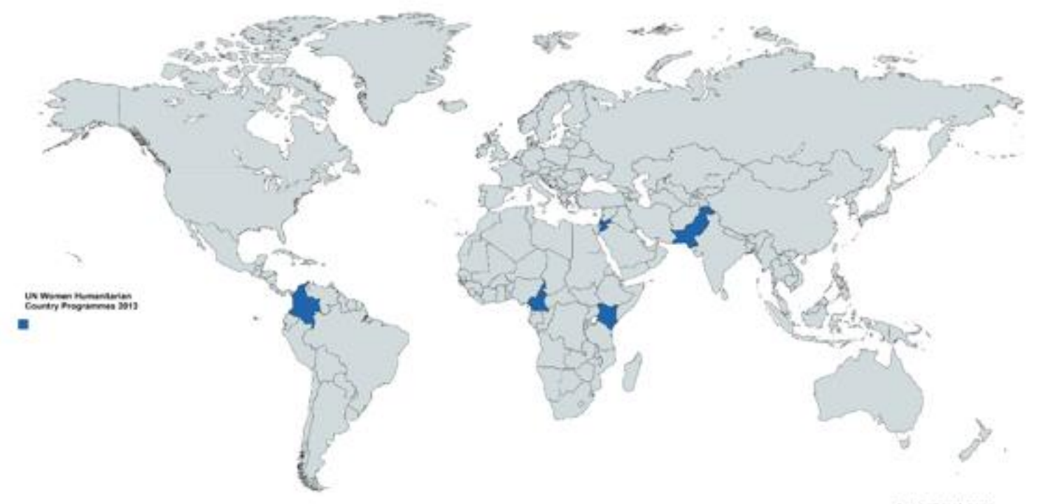
Danted with inspirise's last of

United Nations Entity for Gender Equality and the Empowerment of Women