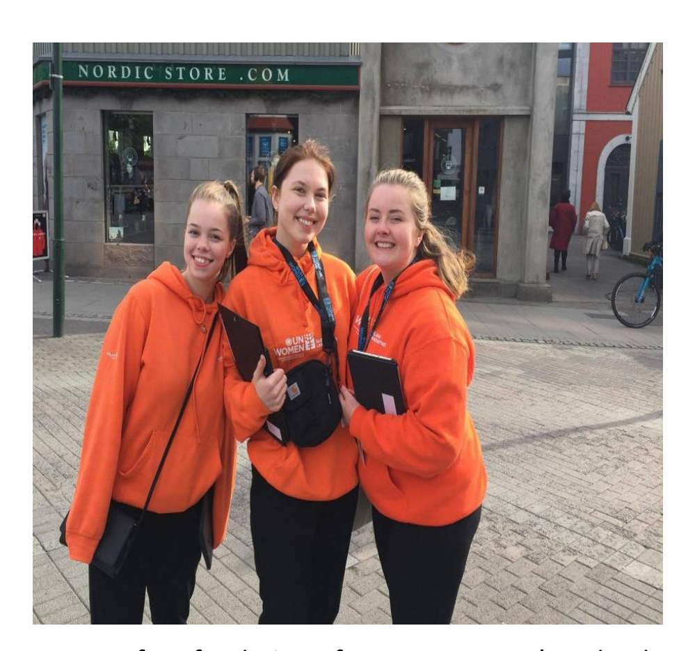
Face-to-face fundraisers from UN Women's Iceland National Committee, raising over $100k in 2018