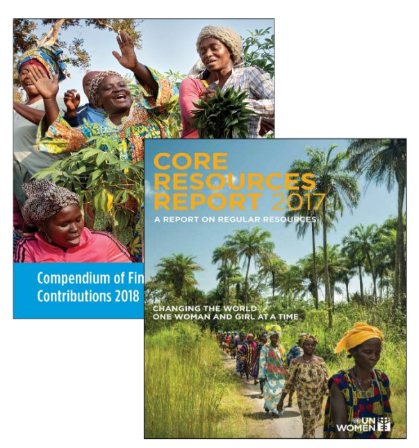
Reports giving visibility to resource partnerships that enable results

Member States are UN Women's most valued funding partners and the foundation upon which UN Women functions, contributing 99% of RR and 66% of all OR in 2018