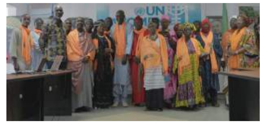
Figure 4. UN Women in Senegal organized a day of consultation with traditional, customary and religious leaders on how to end harmful practices such as child marriage

around the world, standing in solidarity with survivors, advocates, the women's movement and women's human rights defenders. To draw global attention to the issue, iconic buildings and monuments were lit up in orange, the official colour of the campaign, symbolizing hope and a violence-free