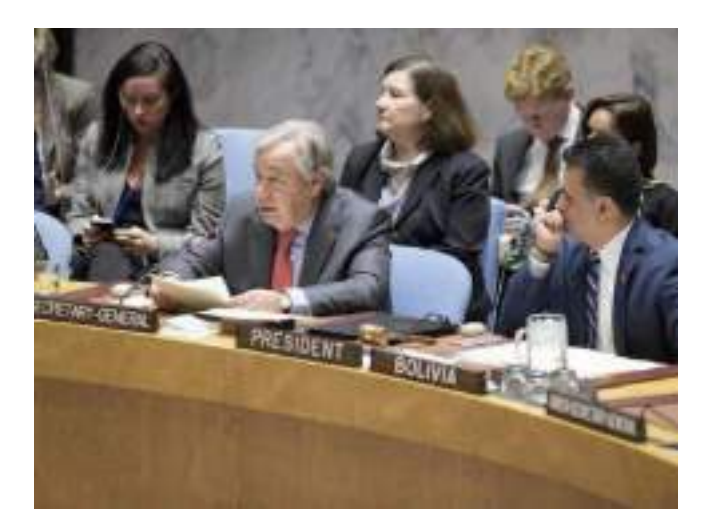
Figure 6 Secretary-General António Guterres (centre) briefs the Security Council meeting on women and peace and security. UN Photo/Manuel Elias.

Every year, we make laudable commitments," Secretary General, Mr. Guterres said at the Security Council's annual high-level debate on women and peace and security. "But they are not backed with the requisite financial and political support," he continued, noting lack of inclusion in mediation efforts and limited space for women to participate as peacebuilders.