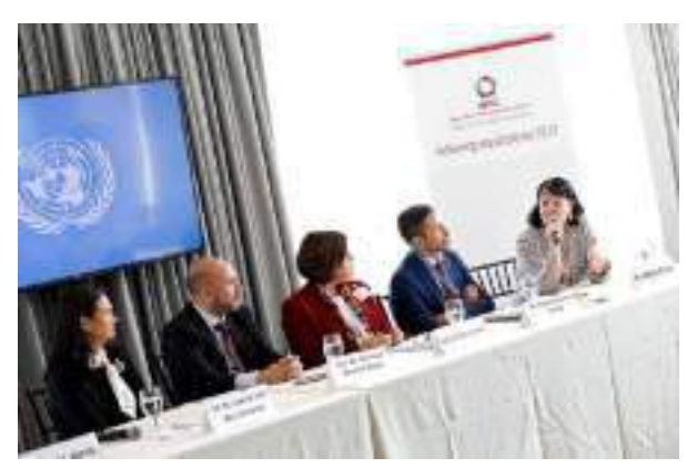
Figure 7. Sharan Burrow, General Secretary, International Trade Union Confederation speaks at the Equal Pay International Coalition Pledging event during the UN General Assembly in New York.

Globally, and in every sector of the workforce, women are paid less than men for doing work of equal value. Unequal pay is one of the most persistent barriers to women's success at work and to economic growth, and a critical problem that has been prioritized in the Sustainable Development Goals (SDGs), in particular SDG 8.5 and 5. Equal pay, in addition to empowering women, can have a significant impact on achieving other key goals, such as promoting inclusive societies, reducing poverty, and creating conditions for decent work and gender equality.