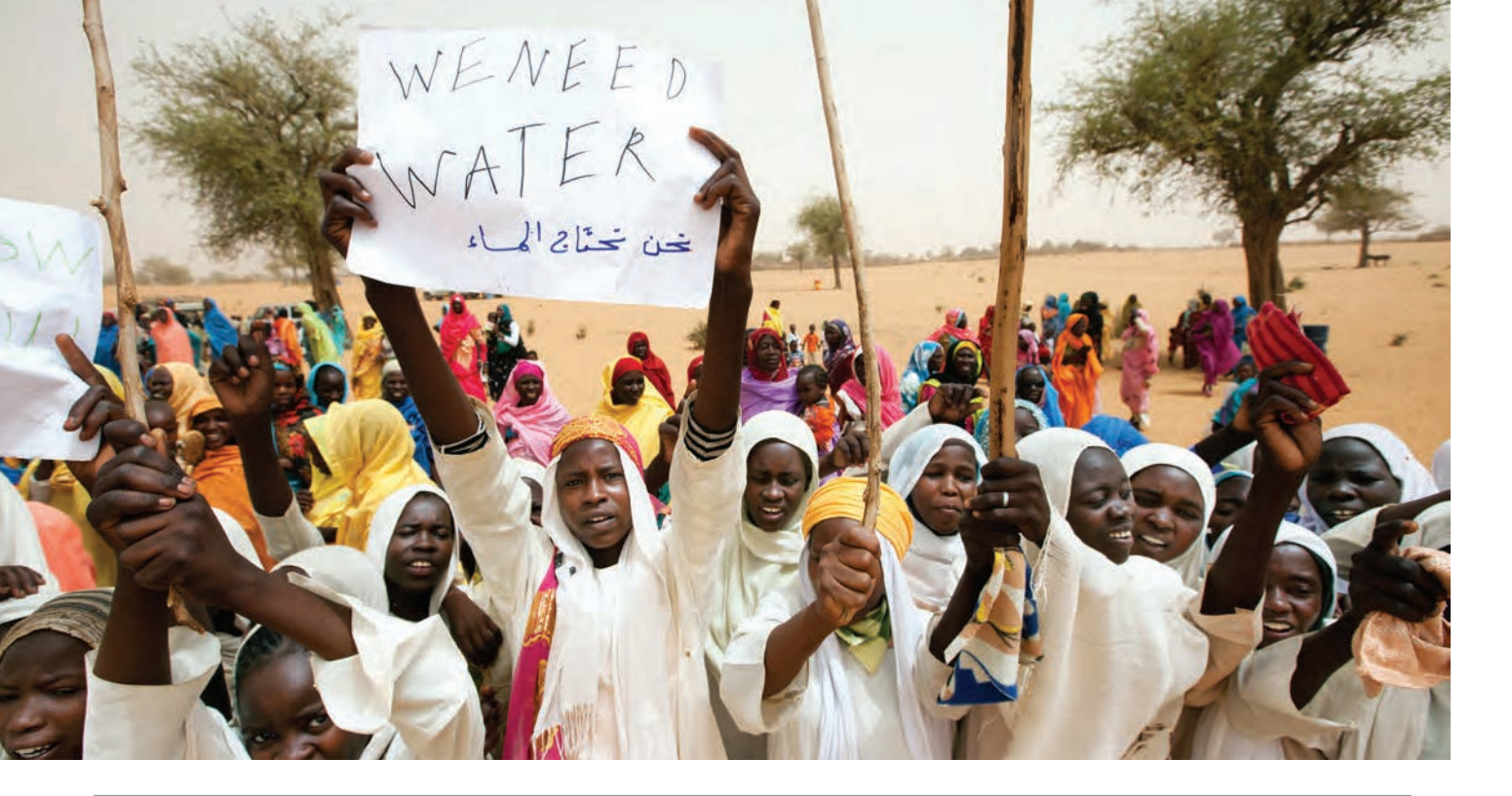
Residents of Forog, North Darfur protest a serious shortage of water.