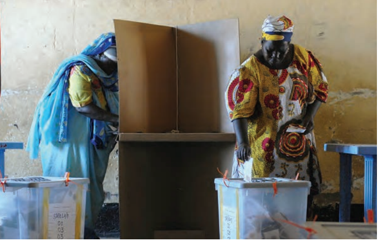
Women in Juba, Sudan, vote in their country's national elections, the first to take place in almost 25 years. Originally set for 11 to 13 April, the date to vote has been extended by an additional two days.

to counteract pressure to follow family voting patterns. Ensuring that national, regional and international election observers understand that family voting is illegal and can recognize and document it should be a critical part of election observer training. Observers should also have checklists to understand possible gender gaps in election processes. OSCE has prepared a comprehensive Handbook for Monitoring Women's Participation in elections with a checklist for its election observers. The checklist can be easily adapted for different contexts.