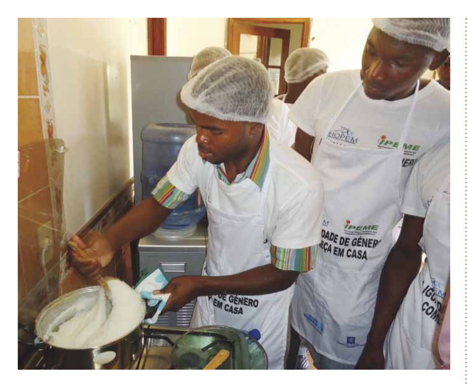
ABOVE: Who says men can't cook? An innovative programme sponsored by UN Women in Mozambique puts men in the kitchen to experience first hand how to break free of gender stereotypes. They also reflect on violent behaviour—and how to stop it.