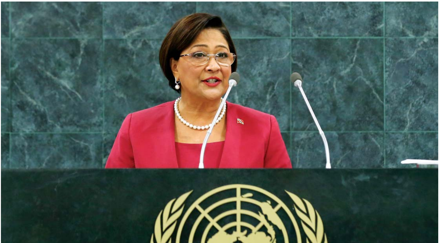
From the top: Portia Simpson Miller, Prime Minister of Jamaica, during her arrival to Geneva to participate of the 50th Anniversary of UNITAR. Photo: United Nations. Kamla Persad-Bissessar, Prime Minister of Trinidad and Tobago, addresses the general debate of the 68th General Assembly of the United Nations. Photo: United Nations.