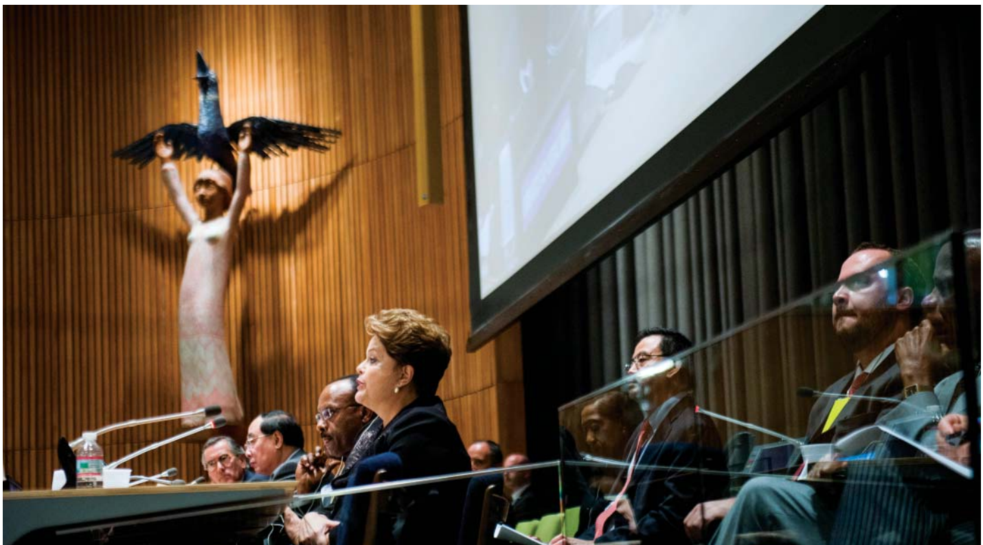
From the top: The Presidents of Chile, Michelle Bachelet, and Argentina, Cristina Fernández, during their participation at the BRICS UNASUR Summit in Brasilia. Dilma Rousseff, President of Brazil, addressing the participants during the inauguration ceremony of the High Level Political Forum on Sustainable Development.