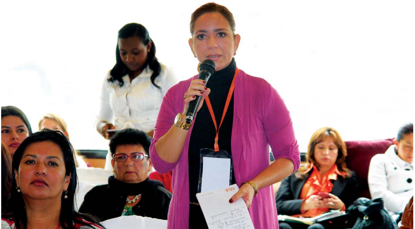
From the top: Meeting of women for parity in Uruguay. National Summit of Women Elected in Colombia organized by the Ministry of the Interior, UNDP, UN Women, International Cooperation Gender Group, NDI and IDEA International.