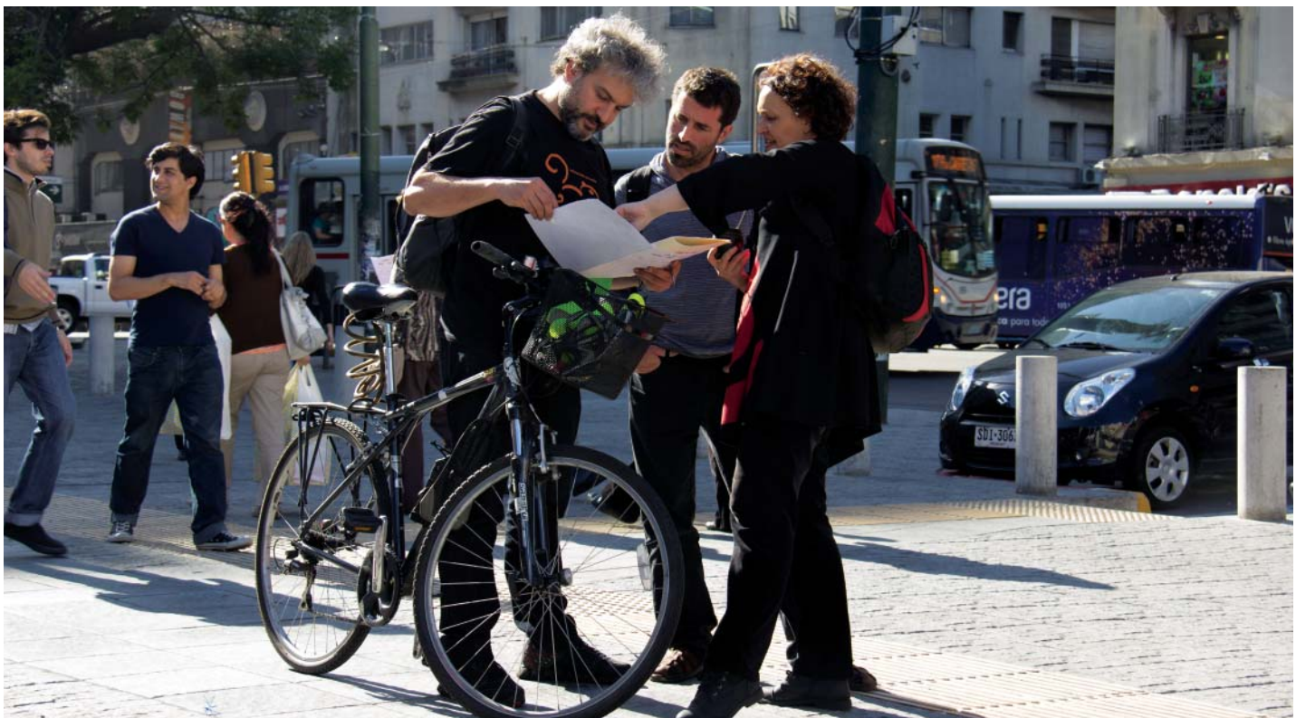
From the top: The President of Chile, Michelle Bachelet, arrives at the Palacio de la Moneda. Collection of signatures for parity democracy in Uruguay, organized by Cotidiano Mujer, CIRE and CNS Mujeres, and supported by UN Women.