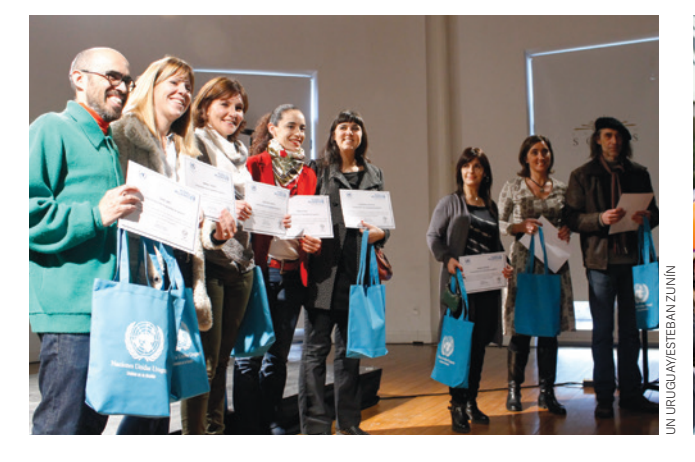
The " Ready for the list " campaign in 2014 aimed to raise public awareness on the importance of having more women in decision-making in Uruguay, as per the quota electoral law of 2009. It featured wellknown Uruguayan artists, businesswomen and journalists and aired on TV channels across the country, and via social networks.