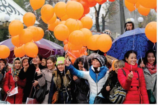
As the secretariat to the Secretary-General's Campaign to End Violence Against Women (UNITE), UN Women organized events around the world as part of the yearly 16 Days of Activism against Gender-Based Violence . In 2013, the theme was "Safe spaces for women and girls", and UN Women promoted the recommendations of the 57th Session of the Commission on the Status of Women.