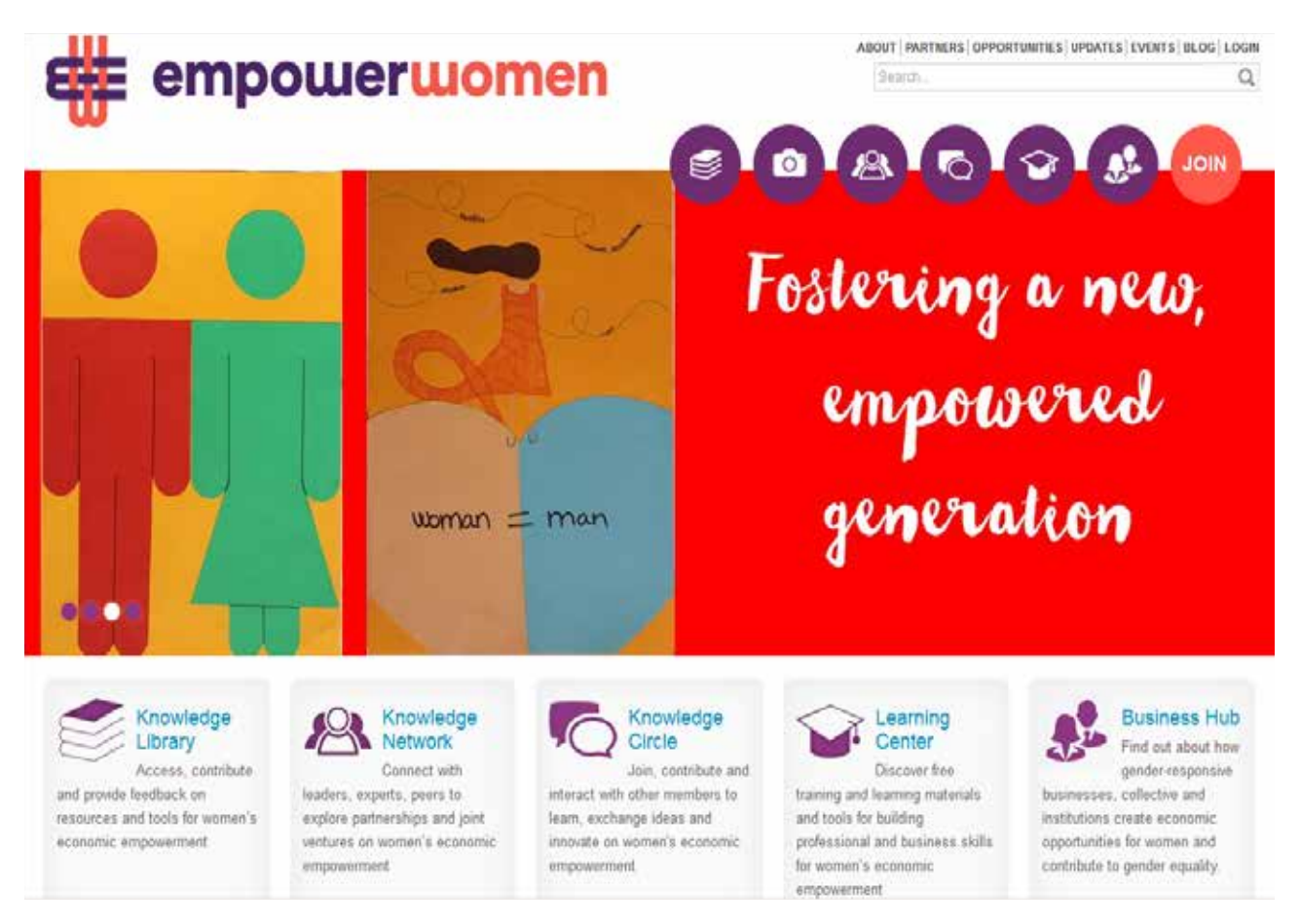
UN Women's Economic Empowerment Knowledge Gateway

The Women's Economic Empowerment (WEE) Empower Women<sup>20</sup> is a virtual knowledge mobilisation and dissemination platform that currently receives 300 hits per day. Empower Women was successfully used to increase the reach of the Sharefair<sup>21</sup> through blogs, articles and news from various sources. This generated 4,350 visitors and 11,911 page views per month for the event by the end of 2014.