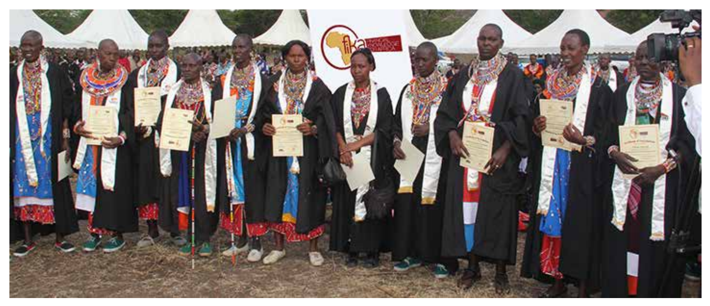
Participants at an Equity Group Foundation entrepreneurship training

In 2014, a UN Women staff member was seconded to the Equity Group Foundation with a mission: to contribute to the integration of gender in the financial sector. The secondment allowed for the provision of direct technical support on gender-mainstreaming in the Group's policies and programmes; it led to the development of more gender-responsive financial and entrepreneurship packages and initiatives.