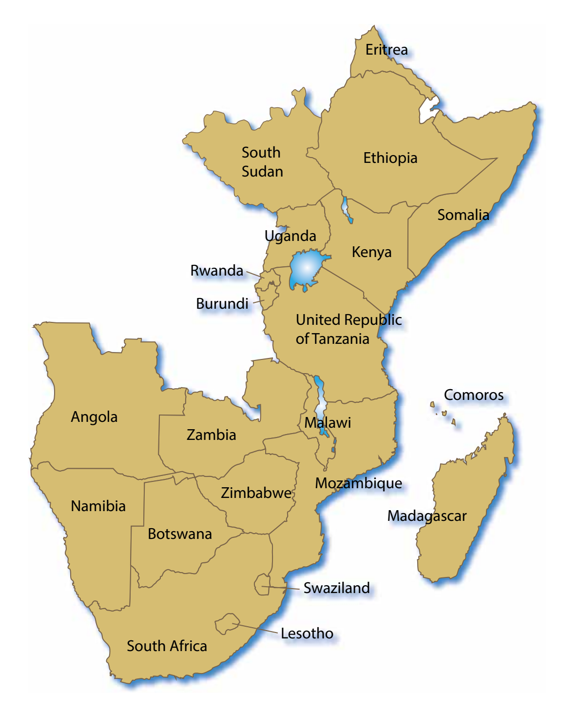
Map of the Eastern and Southern Africa Region