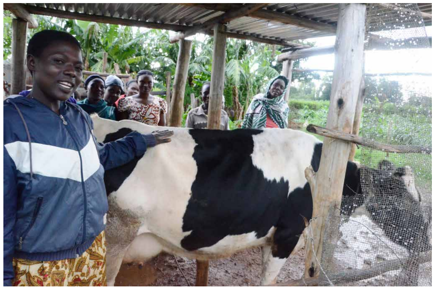
A SACCO beneficiary

Clearly, there is a great need for this service. In its first eight months, the SACCO grew its membership from nothing to over 10,000.