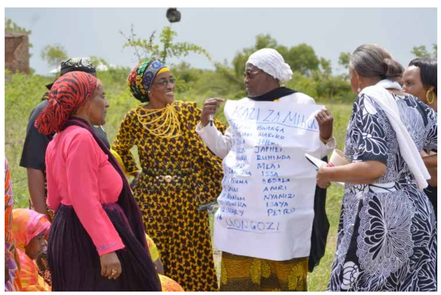
Participants at the Horohoro platform for cross-border women traders on the Tanzania/Kenya border

The regional WEE team is working on the adoption and implementation of national and regional plans, legislations, policies, strategies and budgets that strengthen women's economic empowerment. At the same time, the team is collaborating with gender equality advocates to influence economic policies and poverty eradication strategies.