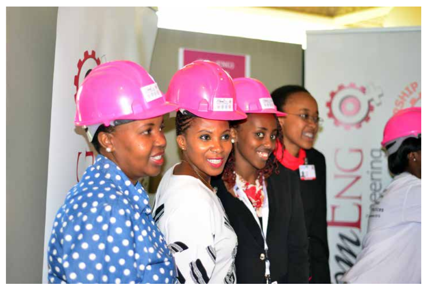
Participants at Sharefair 2015

Four hundred and thirty participants – including researchers, policymakers, development agencies, United Nations agencies, regional economic commissions, the African Union, civil society organisations, women in the extractive industries, business leaders, investors, private sector representatives and practitioners – gathered at the Sharefair to discuss innovations, good practices, evidence from research and documented data, and legal frameworks and policies for mainstreaming gender in the extractive industries sector. The event also provided opportunities for networking, advocacy and capacity building in support of women in the extractive sector.