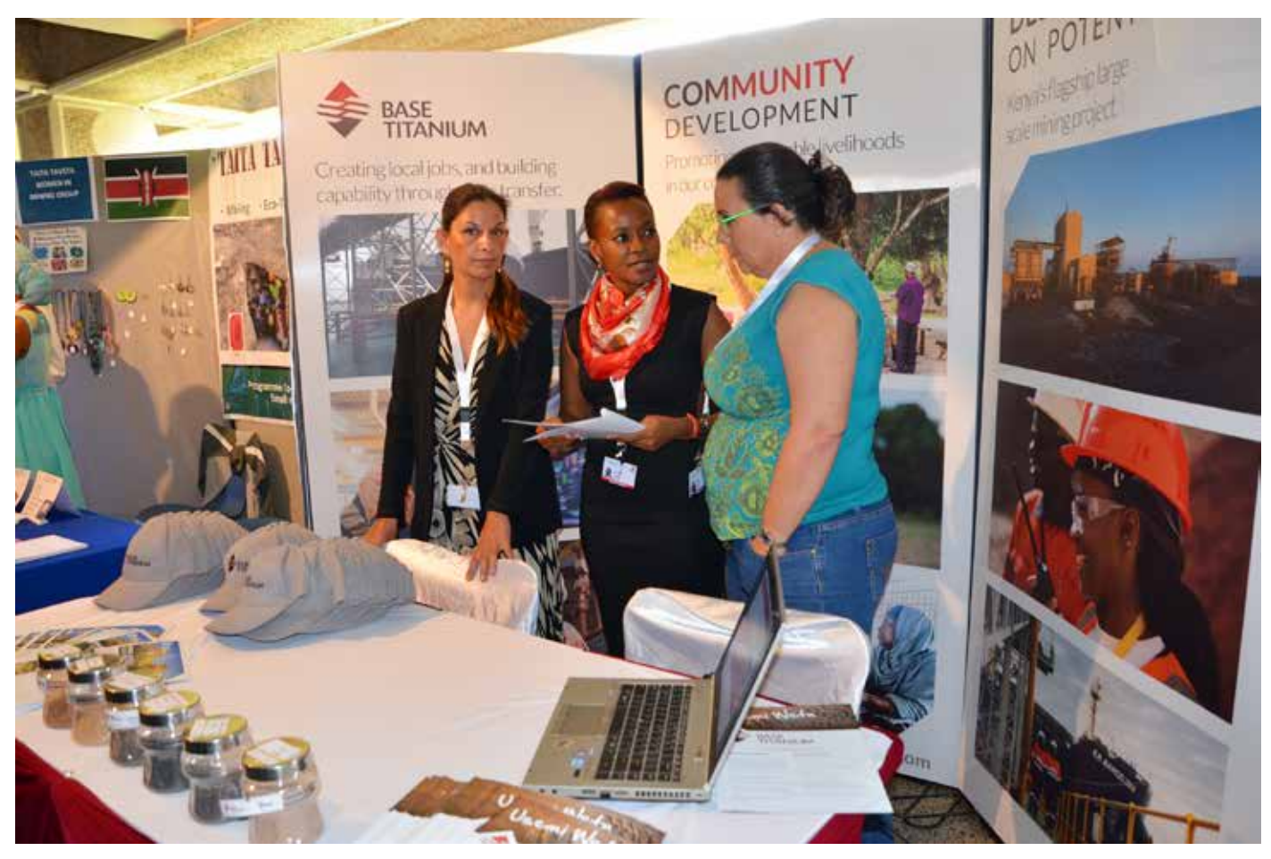
Involvement at Sharefair 2015 of companies in the extractive industries

It has also resulted in a new version of one of PWYP's key advocacy tools: Chain for Change. This tool was revised to specifically incorporate Gender Equality into each element, and has now been published under the name Extracting Equality - A Guide .<sup>19</sup> The tool is a step-by-step guide that examines all twelve steps of the extractive value chain and, at each step, provides considerations to make and questions to ask in order to ensure women are not left out of natural resource governance. The tool targets those involved in the extractive industries sector: community members, civil society organisations, non-governmental organisations, private companies, governments and UN agencies.