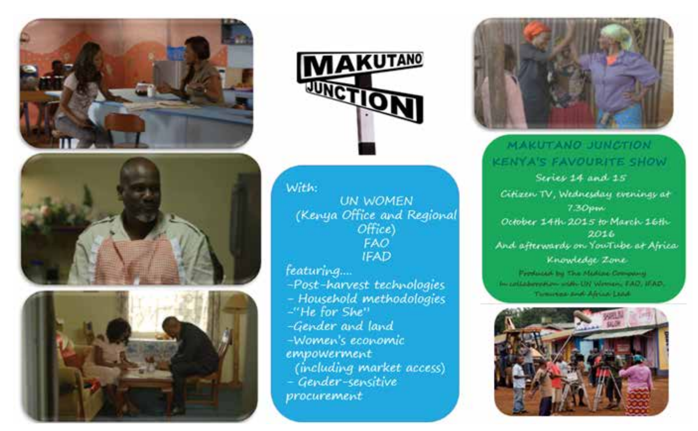
Screenshots of Makutano Junction, a popular TV show addressing important issues for rural women

The popular TV show called "Makutano Junction" addresses issues of critical importance for rural women such as promoting women's access to land and public procurement, women's economic empowerment through engagement in markets and trade, and the use of household methodologies that help women and men collaborate to achieve shared household goals. The series also cover men's support to women, and mentioned the UN Women HeForShe Campaign.