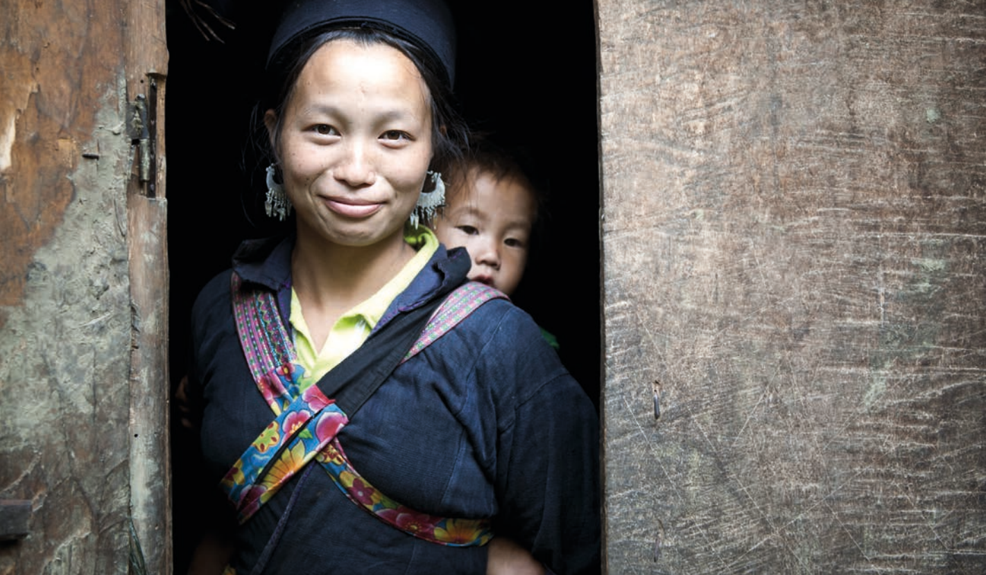
From top: A participant at the First World Conference on Indigenous Peoples © UN Photo / Loey Felipe. A Hmong woman and her baby in the village of Sin Chai, Viet Nam. © UN Photo / Kibae Park.