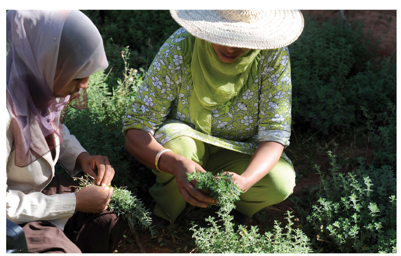
Photo: In Morocco, UN Women helps women cope with climate change-induced livelihood threats. We support economic interest groups like the Annama Association, whose members grow medicinal and aromatic plants in Errachidia.

In UGANDA, in partnership with the UN Foundation, WHO, UNICEF and UNFPA, UN Women systematically engaged the media in raising awareness of policymakers on women's health and energy service provision in health institutions. The project aimed at bringing to light the challenges that women face in accessing health services, especially maternal and child health services in light of inadequate power and energy supply to health centres in Uganda. The media with support from UN Women visited health centres in selected districts and produced many moving challenges experienced by women especially during pregnancy. The documented challenges have continued running in different media, with the result that the Government has adopted several resolutions to improve energy services in health centres for the benefit of women and children. UN Women organized consultations to mobilize and advocate to gender, health and energy stakeholders in the public and private sectors, CSOs, the UN system, and other partners to ensure electricity provision to health facilities. The consultations explored the extent to which the policy environment is gender-responsive and