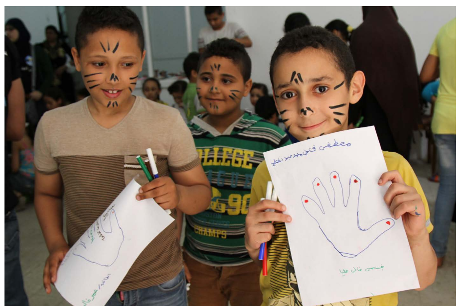
Photo: Giza, Egypt (2015): Art therapy, music and drama can be powerful weapons against sexual abuse and harassment. That's how volunteers with UN Women's Safe Cities initiative teach children and community members important lessons about the value of their bodies and how to prevent sexual violence.

In Morocco, the Marrakech Safe City Programme began implementation in 2014. Informed by evidence gathered in the first-ever study conducted on sexual harassment and other forms of violence against women in public spaces in Gueliz District, community-based approaches were used to mobilize women and girls and men and boys to promote women's rights to access and use public spaces free from violence and fear of violence. A new partnership established in 2015 with the Autobuses Luarca, S.A. (ALSA) bus company led to the training of over 500 bus drivers on the issue of sexual harassment against women and girls in and around bus stops and on buses and ways to address it. It also included the production and broadcasting in buses of three awareness-raising videos on sexual harassment against women and girls reaching 200,000 transit users daily. In the Rabat Safe City Programme, launched in 2015, transformative initiatives have been developed and integrated into media messaging. This includes strengthened partnerships between UN Women and NGOs