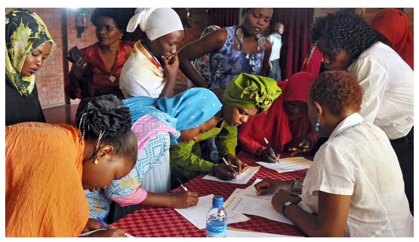
Photo: Women being trained as Women's Situation Room observers in Coastal Region during the preparation for the 2013 General Elections in Kenya. The Women's Situation Room is an early warning and rapid response mechanism against violence arising before, during and after elections. UN Women supports many Women's Situation Rooms in numerous African countries, including in Mali.

In ALBANIA UN Women launched an awareness-raising campaign to introduce gender-responsive budgeting in the southern cities of Fier, Berat and Përmet. The three cities organized Albania's first-ever public consultations with citizens to openly discuss community needs as part of their budget planning. Around 200-300 people participated in each town, after which municipal authorities adapted their preliminary budgets to reflect community needs. In 2016, UN Women has expanded the campaign to Tirana, Albania's capital, and to the southern municipalities of Vlora, Saranda and Këlcyra.