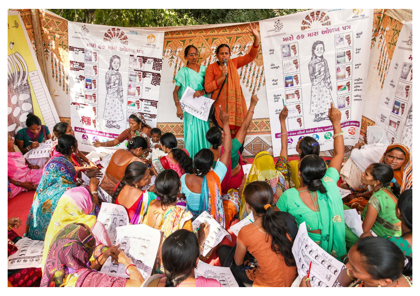
Photo: Gujarat, India. An "information fair" in Shihore, Gujarat, bringing together local women and their elected leaders, where community members shared their experiences of using technology to catalyse change.

concerning domestic workers was undertaken. A gender analysis was also undertaken on the procedures and activities of private employment agencies in order to reveal gaps and give views on following the principles of decent work for domestic workers. The analysis was shared with the ministries responsible for labour migration in Kazakhstan, Kyrgyzstan and Tajikistan, and the RMP provided support with the development of a Code of Honour (Conduct) for private employers and employment agencies and a model labour contract for domestic workers. Additionally, UN Women presented women's empowerment principles and HeForShe at the Astana Economic Forum 2016. This annual event brings together representatives of the world's economic community, current and former Heads of State, figures from the scientific world and business people to discuss economic development issues and changes in the global economy.