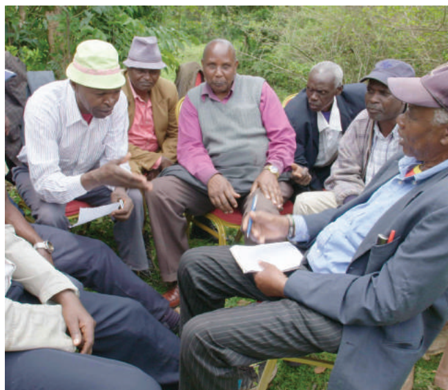
Engaging men in their safe spaces to have candid conversations on their role in preventing sexual harassment and other forms of GBV in their community