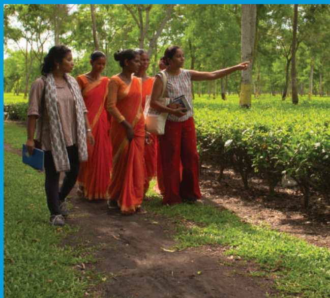
Women tea workers participate in women's safety audits identifying spaces that are unsafe for women and girls, and can be transformed.

The design of public spaces most often does not consider women's subjective experiences or perceptions of safety. This factor leads to further exclusion of women and girls by restricting their access to those spaces for education, work, commuting or even leisure.