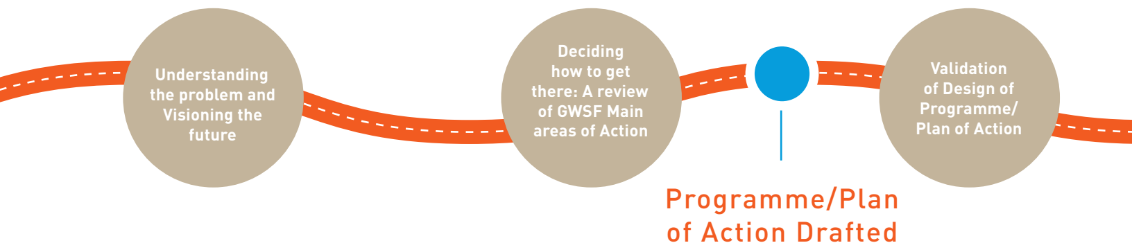
Diagram 1: Programme design sequence of sessions

To assist a producer or their main implementation partner, please see example of content areas that can help to inform the development of a Terms of Reference for a Programme Steering Committee .