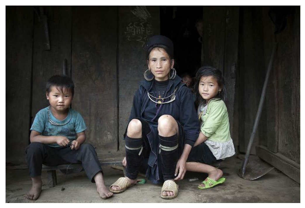
Above: Vietnam. A H'mong family in Sin Chai hill tribe in the village of Sapa.

Telecommunications form a critical part of measures to empower women and ensure that they have access to information in a timely and cost-effective way. SDG 5 Target 5(b) calls for States to enhance the use of enabling technology, in particular ICT, to promote the empowerment of women. One global study found that 93 per cent of women felt safer and 85 per cent felt more independent because of the security offered by owning a mobile phone.<sup>94</sup> However, care should be taken with regard to the impact of information technology on human rights defenders, monitoring staff and journalists who are engaged in investigations and monitoring activities that are politically sensitive or viewed as threatening, in which case, women can be placed at a heightened level of risk as a result of their activities.<sup>95</sup>