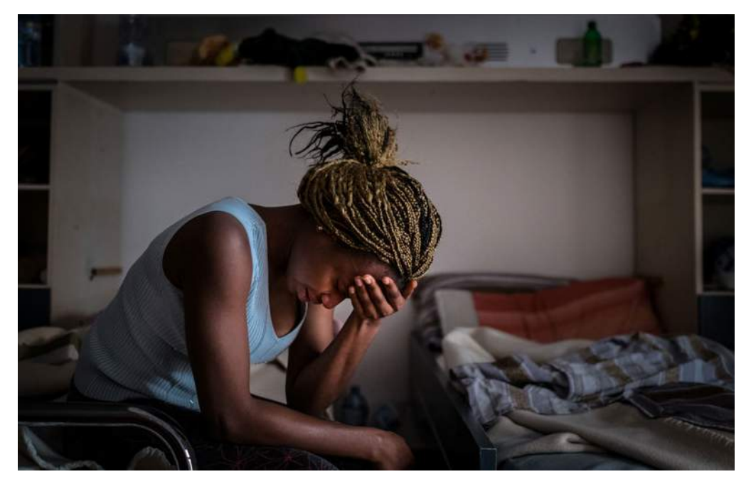
Above: Italy. Woman from Benin City in Nigeria, cries on a dormitory bed in the safe house where she now lives, on the outskirts of Taormina in Sicily.

Serious violations of international humanitarian law: Serious violations of international human rights law usually fall within the "Grave Breaches" regime of Article 147 of the ICRC Geneva Convention IV relative to the Protection of Civilian Persons in Time of War as well as those listed under Article 3 of all four Geneva Conventions. These cover willfully killing, torture or inhuman treatment, including biological experiments, willfully causing great suffering or serious injury to body or health, the passing of sentences and the carrying out of executions without previous judgment pronounced by a regularly constituted court, unlawful deportation or transfer or unlawful confinement of a protected person, compelling a protected person to serve in the forces of a hostile power, or willfully depriving a protected person of the rights of fair and regular trial, taking of hostages and extensive destruction and appropriation of property, not justified by military necessity and carried out unlawfully and wantonly. Victims of gross violations of international human rights law and serious violations of international humanitarian law have a right to remedy and reparation, as outlined in United Nations General Assembly Resolution 60/147, Basic Principles and Guidelines on the Right to a Remedy and Reparation for Victims of Gross Violations of International Human Rights Law and Serious Violations of International Humanitarian Law.