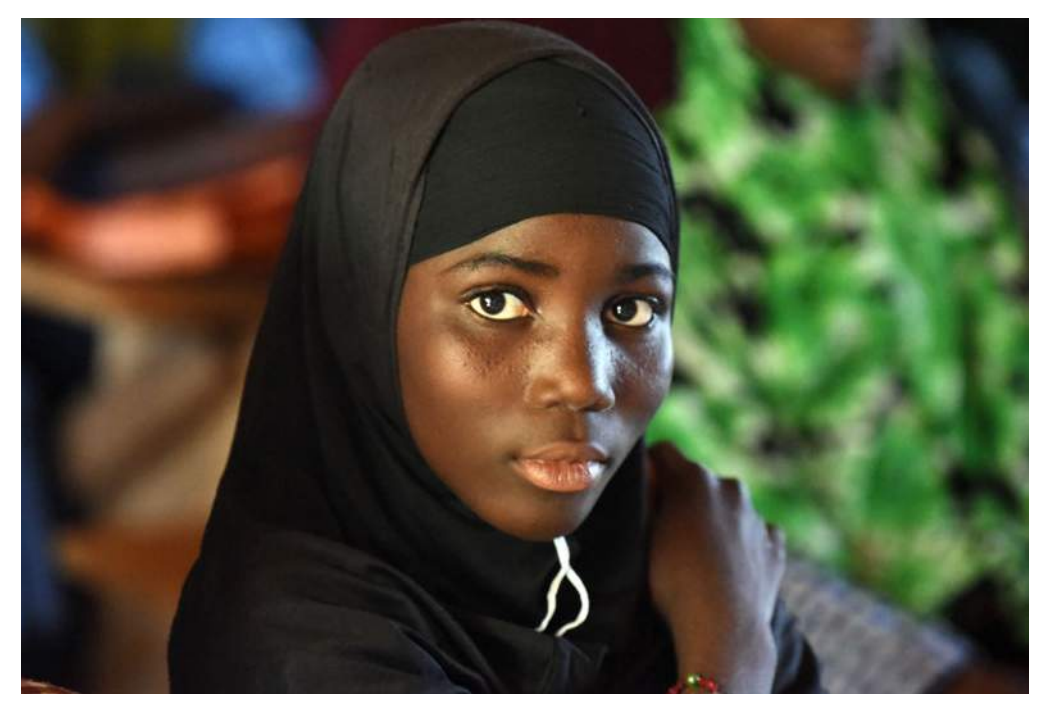
Above: Côte d'Ivoire. Student in class at a French-Arabic school in the town of Korhogo, in the South West of the country.

occurrence of violence against women or the responsiveness of justice systems to this violence.