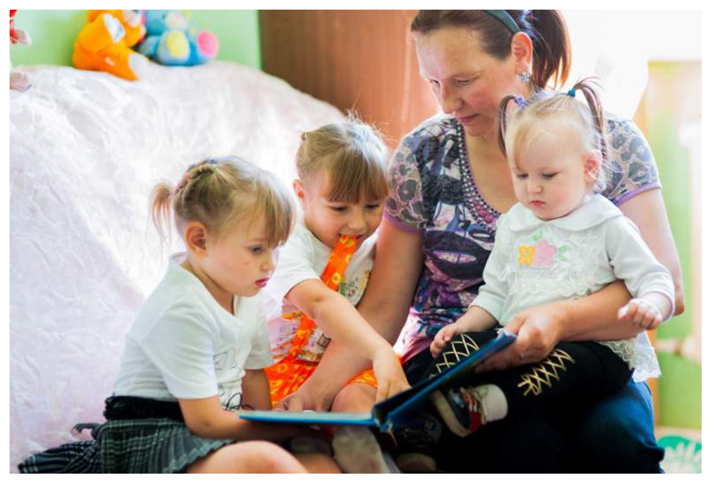
Above: Kazakhstan. Woman and her children at a crisis centre in Temirtau.