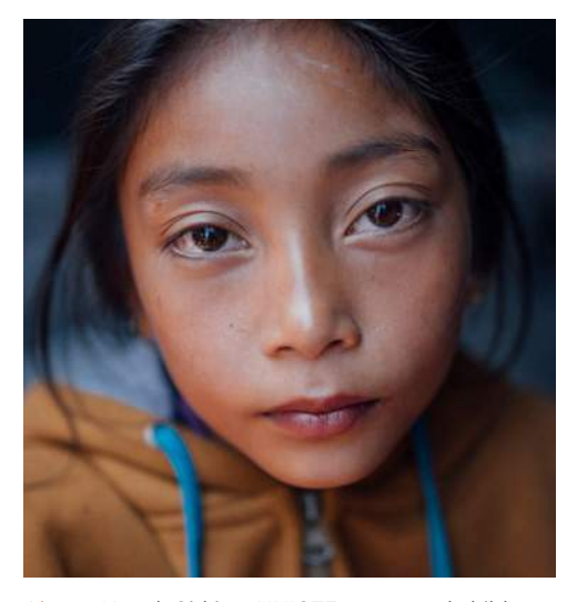
Above: Nepal. Girl in a UNICEF-supported childfriendly space in a camp for earthquake-displaced people in the town of Charikot.

To secure the rights provided for in international law, constitutions and legislation, programming must consider whether justice and security sector institutions are equipped to prevent and respond to violence, including facilitating women's ability to navigate across the justice chain. Process matters for how survivors experience justice: the manner in which they are treated when accessing services and the information they receive along the way will, in the end, play a significant role in determining justice outcomes. For this reason, justice and security sector institutions which deal with different forms of violence must meet the criteria of being available, accessible, able to provide appropriate and enforceable remedies, good quality and accountable.