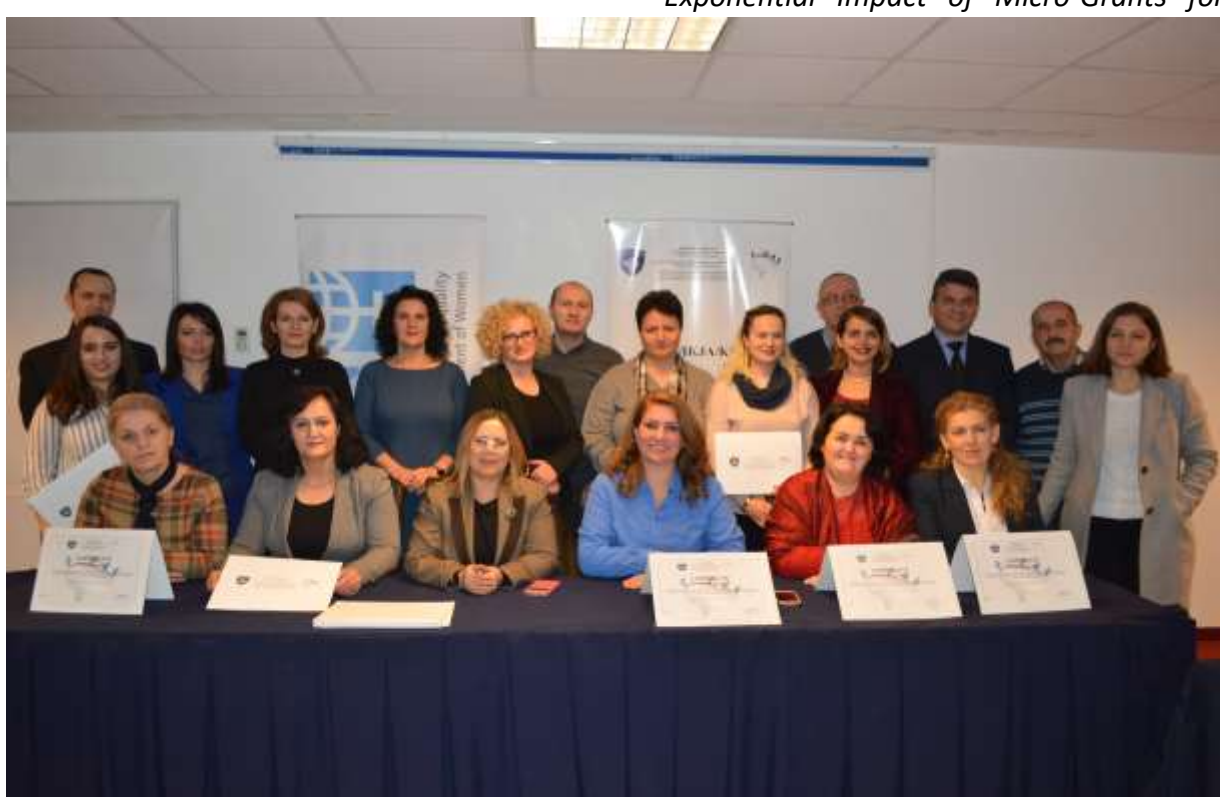
Commission members and their partners received certificates following a training organized by UN Women and the Kosovo Institute for Public Administration.

UN Women report, Bees of Change: The Exponential Impact of Micro-Grants for