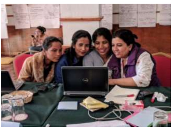
Participants at the computer skills and digital advocacy training.

victims of the civil war, has been progressing extremely slowly, in part due to post-war elites having little interest in revisiting the crimes of the past. Progress on justice and recognition for CRSV survivors has been especially slow. At times, the existence of CRSV during the