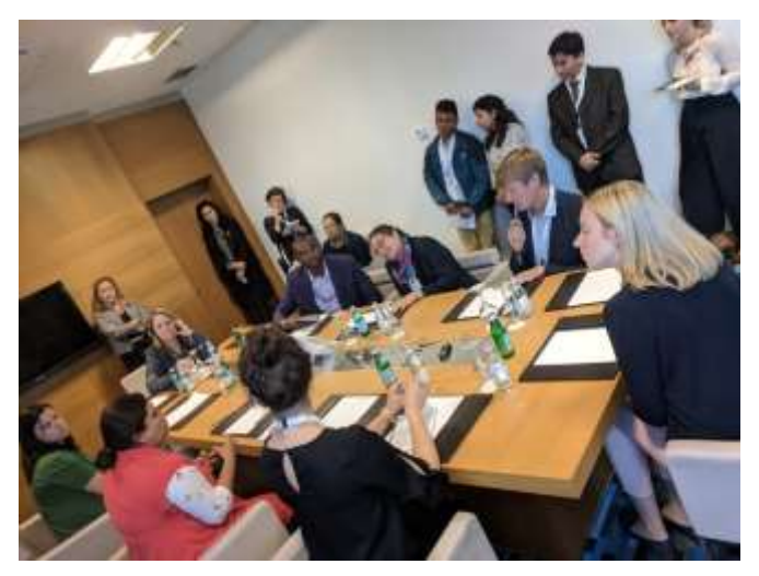
Participants at the workshop in Pristina discussing common challenges in programming on transitional justice.

Holistic approaches to justice: To be effective, sustainable, and transformative, transitional justice cannot exclusively focus on the prosecution of sexual and genderbased crimes but address the full range of harms including social, economic, civil and political rights. Comprehensive service provision and reparations, the identification and recognition of gender champions, increased awareness about human rights, economic empowerment and the possibility of meaningful participation in decision-making processes