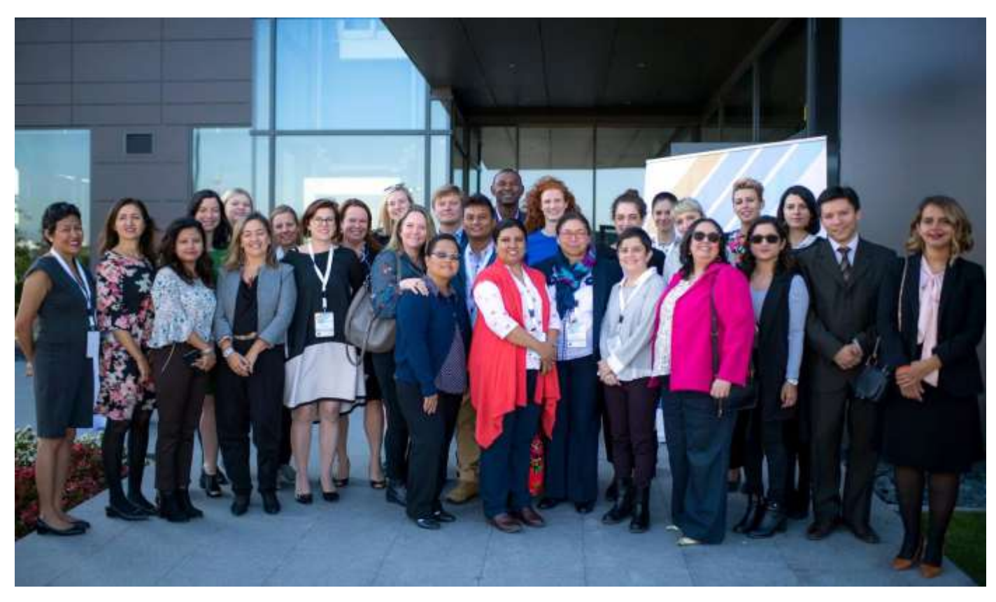
Participants at the Pristina workshop, 9-11 October 2018.

The workshop focused on sharing experiences and key innovations between UN Women country offices and partner organisations, mutual learning and a mapping a way forward for gendersensitive transitional justice. It included individual presentations, interactive discussions and result-oriented group work, which were documented by two note takers and logistically organized by the UN Women programme presence in Kosovo.