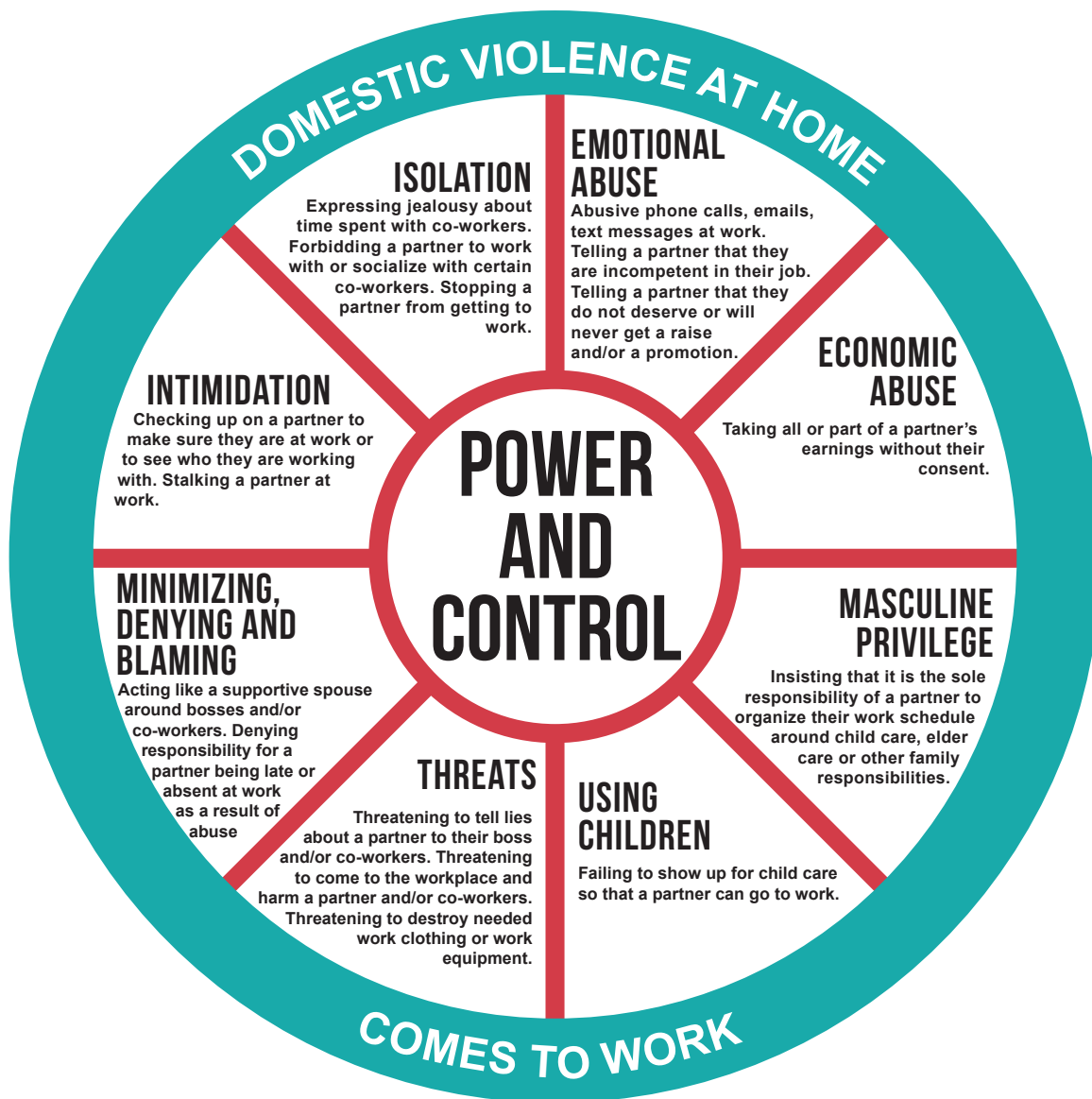
CHART 1: IMPACT OF DOMESTIC VIOLENCE AT WORK

This version of the Power and Control wheel, was adapted by the Centre for Research and Education on Violence Against Women & Children (CREVAWC), Western University, Canada with permission from the Domestic Abuse Intervention Project in Duluth, Minnesota and Futures Without Violence.