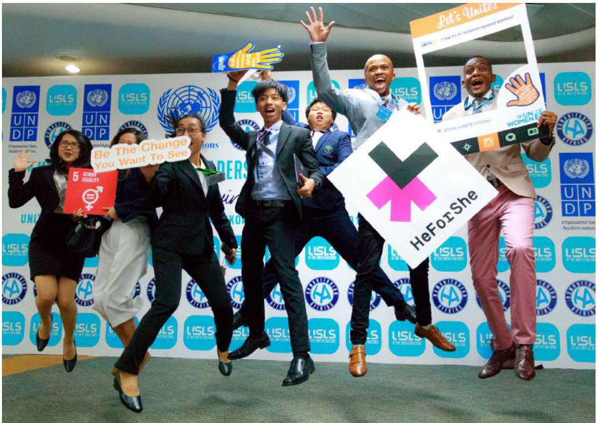
Above: Youth for Gender Equality

The context for the realization of the rights of women and girls and the achievement of gender equality has significantly shifted since 1995. There has been progress, however, no country has achieved gender equality. Over the past decade, feminism has acquired a new dynamic and visibility because of the activism of young people. A new generation of young women are actively involved in different issues that affect their lives personally, reflecting an acute awareness of the limits of legal and social change that has taken place. Young feminist advocacy, activism and mobilization has increased worldwide, gaining momentum, force and support from public and private spheres. Yet, feminist gains are experiencing reversals in many contexts. Young leaders, activists and advocates of gender equality cherish a dream of a better world. Therefore, UN Women’s Youth Plan of Action (2019 - 2021) seeks to empower young women and young men through an intergenerational, intersectional approach, focusing on shifting social norms, supporting policy change, fostering girls’ leadership and amplifying their voices through effective partnerships.