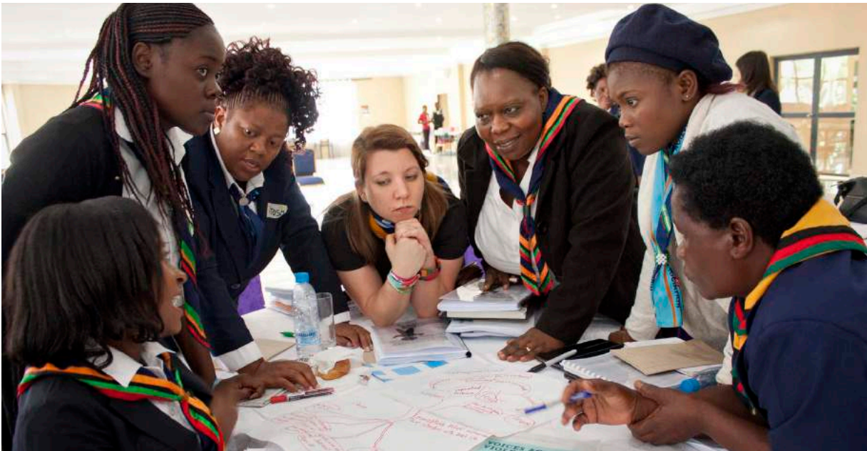
Above: “Voices against violence” curriculum training in Zambia ©UN Women.

The plan will capitalize on UN Women’s convening capacity and effective partnerships with youth-led and youth-serving organizations in countries and regions. Implementation will be through advocacy, supporting and promoting young women’s leadership, and collaborating with suitable partners for maximum impact.