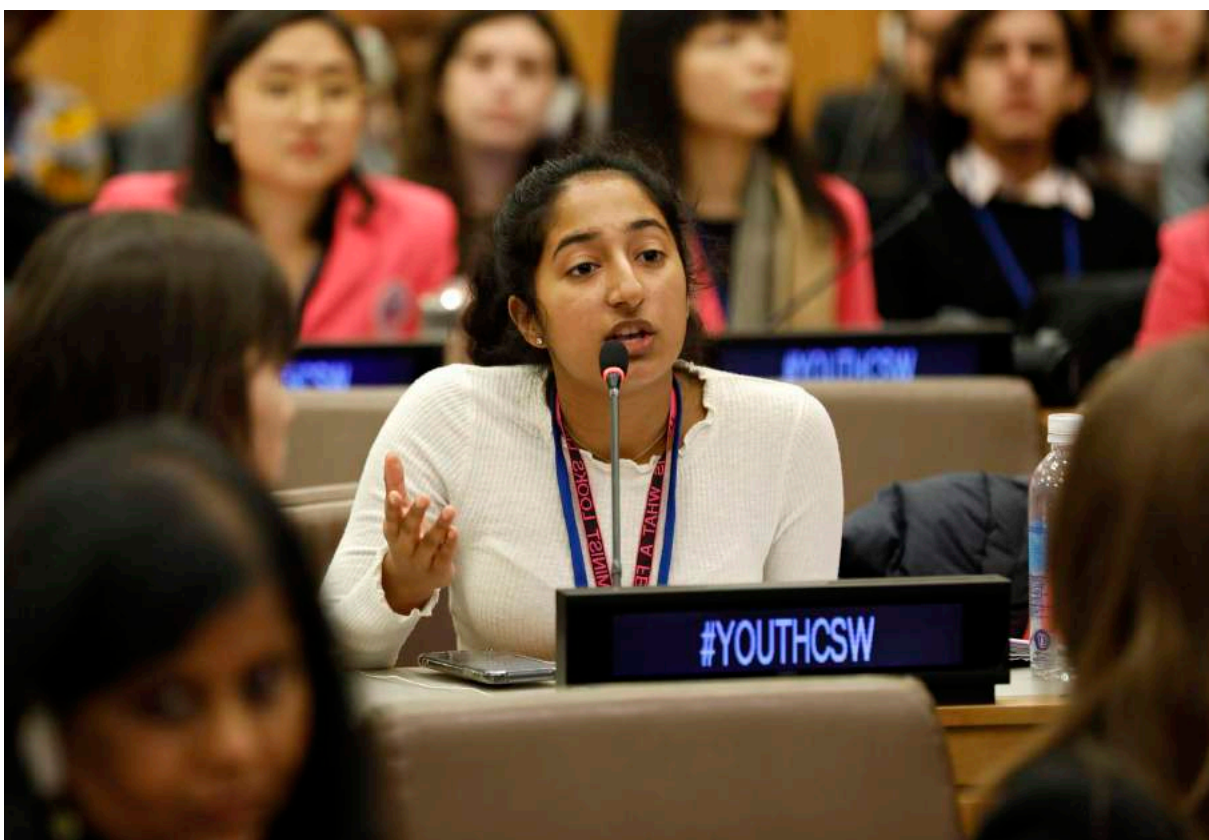
Above: #CSW63 Side Event "Take the hot seat" Intergenerational Dialogue ©UN Women.

Youth Council: UN Women acknowledges that increased youth participation across the organization positions the youth constituency as an empowered consultative body whose innovation capacity ensures that we are keeping up with changing times. Composed of young professionals under 35 years of age working at UN Women, the Youth Council is a reference group that engages with UN Women's policies and frameworks and integrates a youth perspective into the work of UN Women at all levels.