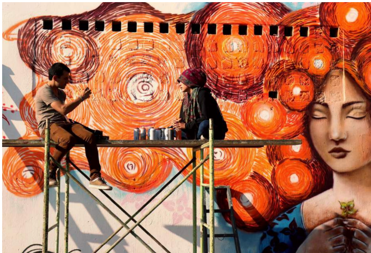
Above: Orange the World 2018 – Guatemala ©UN Women.

UN Women will leverage increased technological connectivity for participatory approaches, particularly through social media, mobile phone and SMS-based feedback loops to improve access to information in their work with youth.