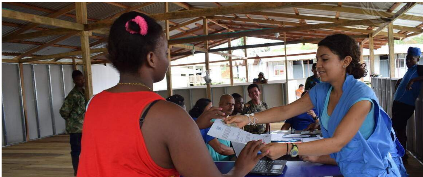
As part of the process of their reintegration into civilian life, members of the Revolutionary Armed Forces of Colombia (FARC-EP) receive certificates for laying down their individual weapons from the UN Mission in Colombia and accreditation from the Office of the country's High Commissioner for Peace.