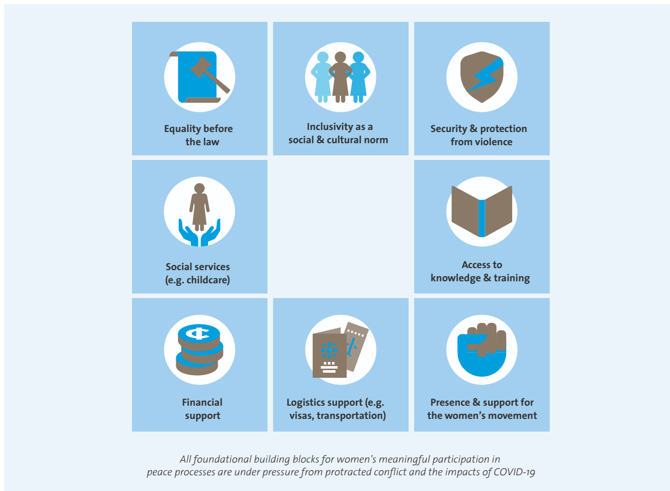
FIGURE 3: The building blocks: For women to enter, remain and contribute effectively in peace processes, an enabling environment is required