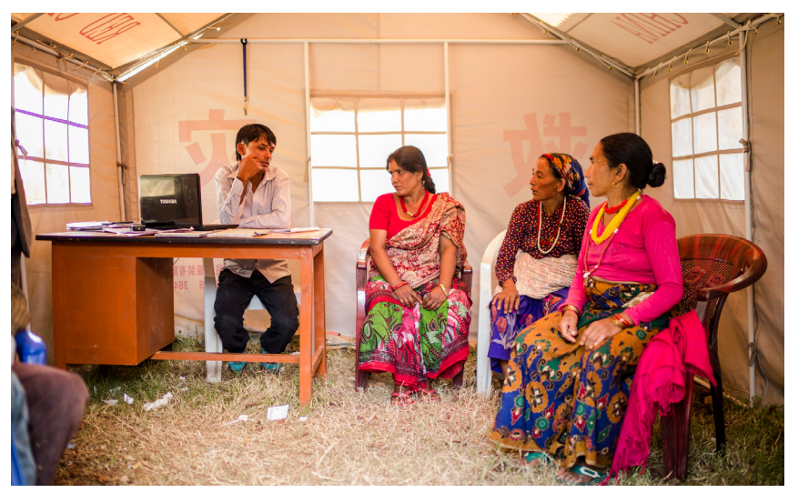
Women seeking relief and recovery information from District Information Desk, Sindhupalchowk.

in the country's path to recovery (while seeking to improve protection against their trafficking and exploitation as migrant workers). Recovery also represents a short-term opportunity to kickstart and restore rural livelihoods as well as promote women's economic empowerment.