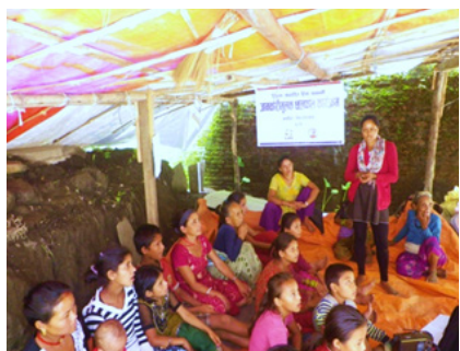
Information volunteer disseminating information at Jalbire, Sindhupalchowk.

GBV responders, in particular national NGOs, have scaled up prevention and response activities,