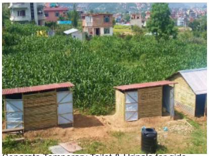
Separate Temporary Toilet & Urinals for girls & boys (Vidhyamandir Se. School, Naikap, Kathmandu).

For schools serving adolescent girls, attention should be given to menstrual hygiene management. Partners should provide