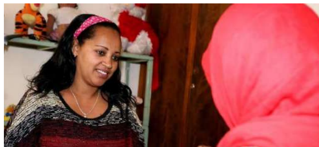
Counselling session for a survivor of VAWG in the Oromia shelter, Ethiopia.

This project also held consultations in local communities, increasing understanding of VAWG and promoting the rights of women and girls. These consultations increased local community leaders' understanding of their commitment in fighting VAWG, including reporting any incidences and to provide support to victims.