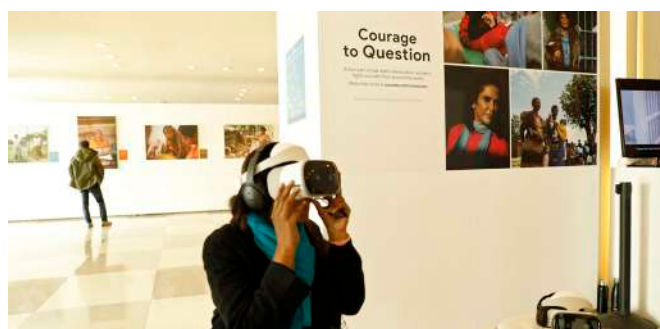
A participant experiences 'Courage to Question', a four-part virtual reality series about women's rights activists from around the world.