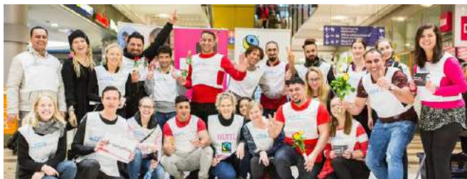
Finland National Committee for UN Women giving out roses in Helsinki in support of the HeForShe campaign.